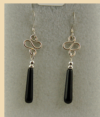
CE 9 Black Onyx drops with Sterling Silver squiggles £45