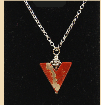
CP6 Jasper 'V' shape and Sterling Silver £30