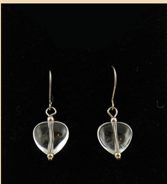
CE 7 Rock Crystal hearts and Sterling Silver £25