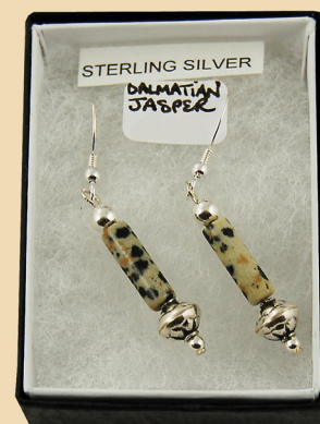
CE12 Dalmatian Jasper cylinders and Sterling Silver £25