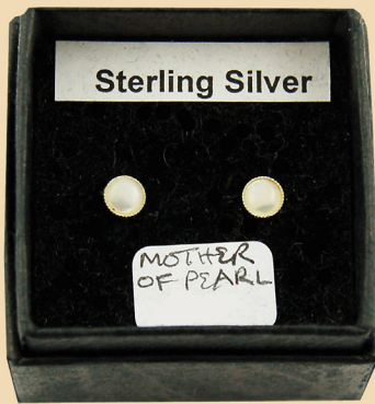
CS 1 Mother of Pearl small round and Sterling Silver £22