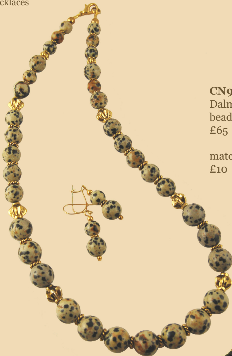
CN9 Dalmation Jasper beads, gold-plated £65