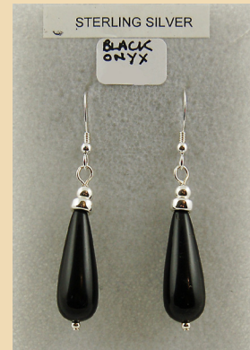
CE3 Black Onyx drops and Sterling Silver £35