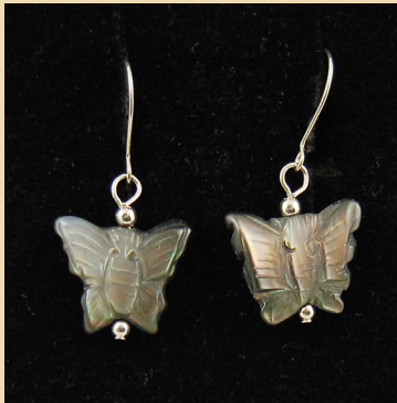
CE4 Mother of Pearl butterflies and Sterling Silver £25