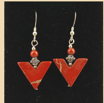
CE6 Jasper 'V' shape and Sterling Silver £27