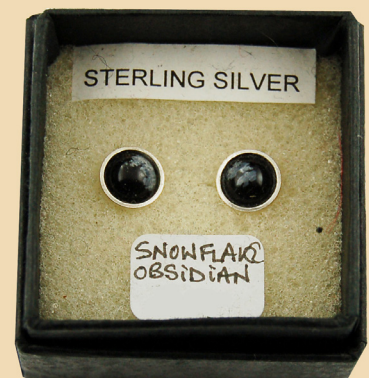
CS6 Snowflake Obsidian small round and Sterling Silver £24