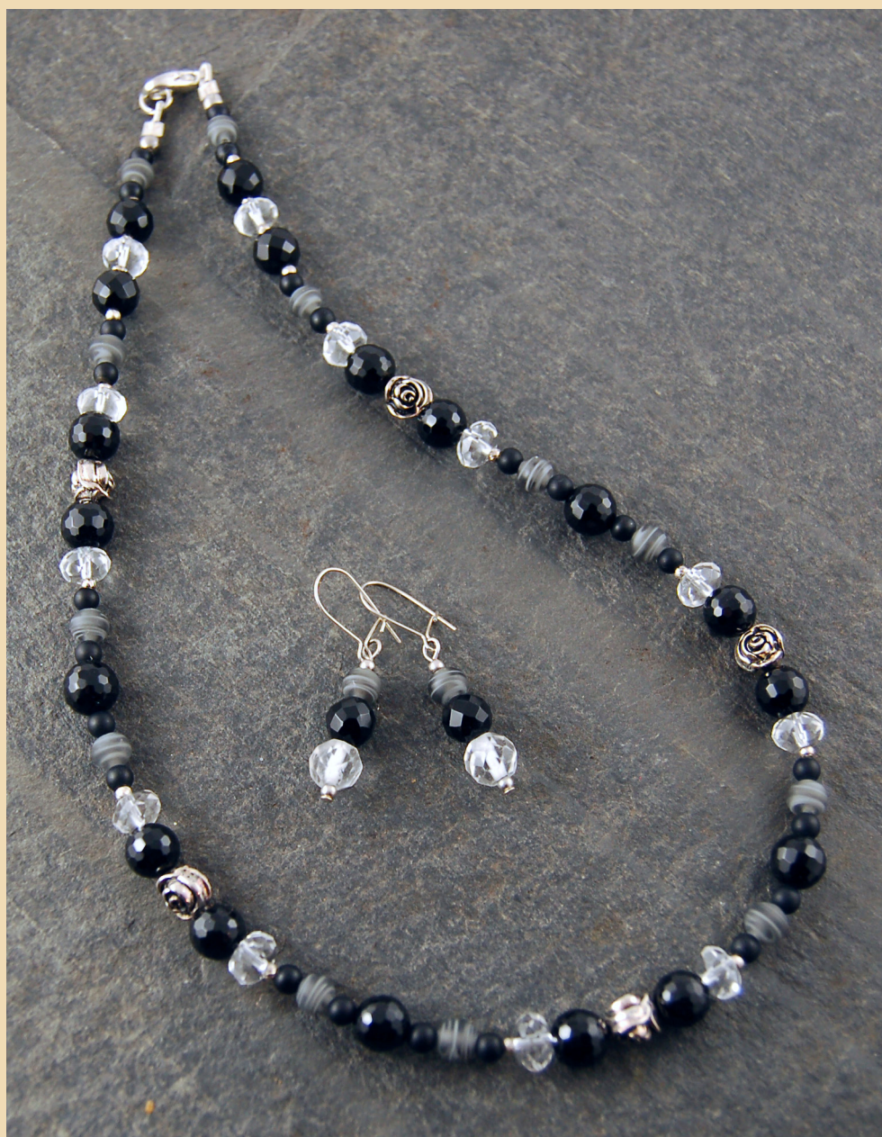
CN4 Faceted Black Onyx and Rock Crystal beads, silver-plated £65