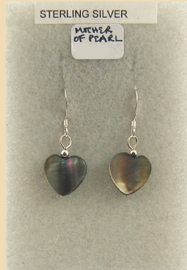
CE2 Black Mother of Pearl hearts and Sterling Silver £25