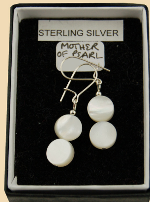
CE14 White Mother of Pearl double coin and Sterling Silver £20