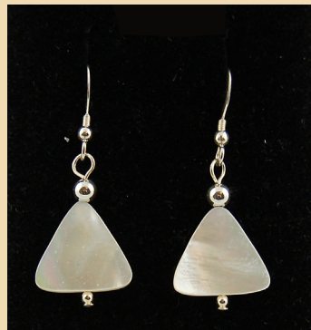
CE5 Mother of Pearl triangles and Sterling Silver £28