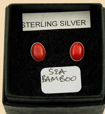
CS11 Sea Bamboo small ovals and Sterling Silver £23