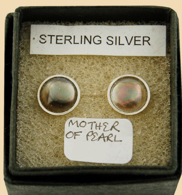
CS13 Black Mother of Pearl round and Sterling Silver £26