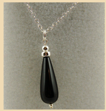
CP3 Black Onyx drop and Sterling Silver £35