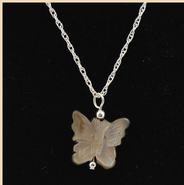
CP4 Mother of Pearl butterfly and Sterling Silver £25