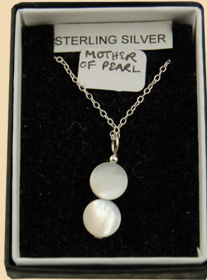
CP14 White Mother of Pearl double coin and Sterling Silver £22