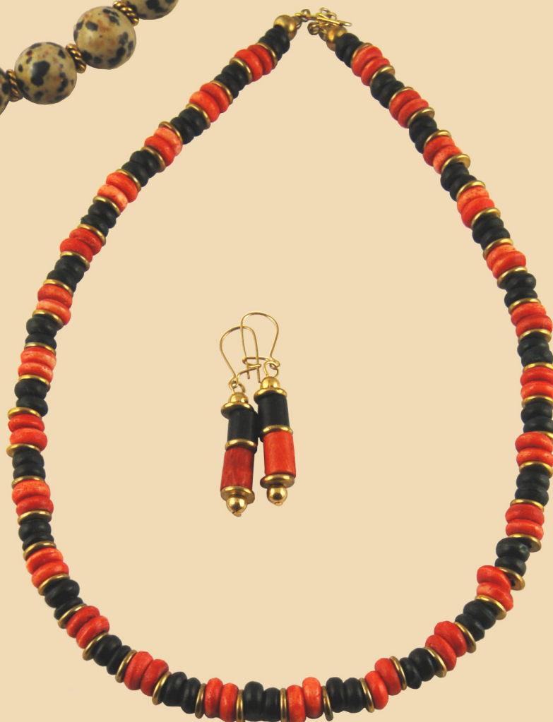
CN10 Red and Black dyed Bone buttons, gold-plated £55