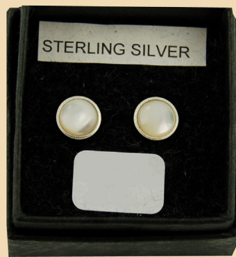
CS 2 Mother of Pearl round and Sterling Silver £24