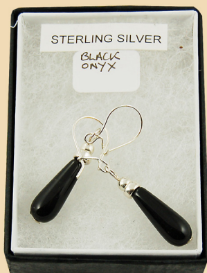
CE10 Black Onyx small drops and Sterling Silver £22