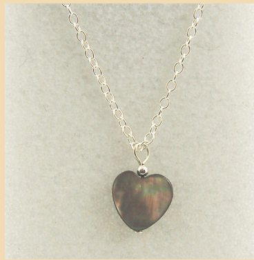
CP2 Black Mother of Pearl heart and Sterling Silver £28