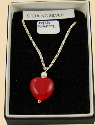
CP12 Red dyed Quartz heart and Sterling Silver £32