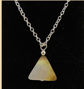
CP5 Mother of Pearl triangle and Sterling Silver £30