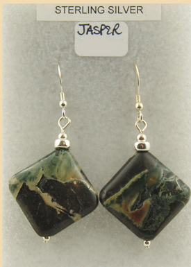
CE1 Jasper slatey diamonds and Sterling Silver £35