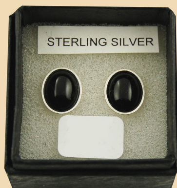
CS10 Black Onyx ovals and Sterling Silver £28