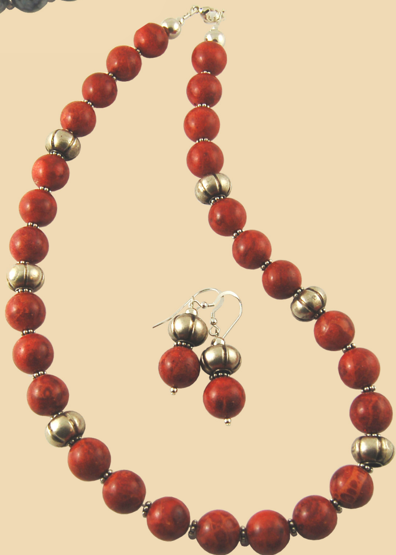
CN6 Sponge Coral large beads and Sterling Silver £88