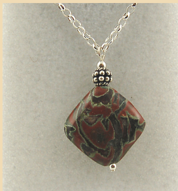
CP1 Jasper slatey diamond and Sterling Silver £40