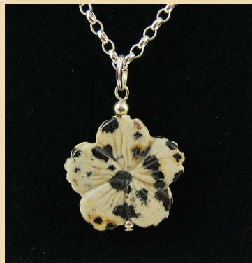
CP8 Dalmatian Jasper carved flower and Sterling Silver £40