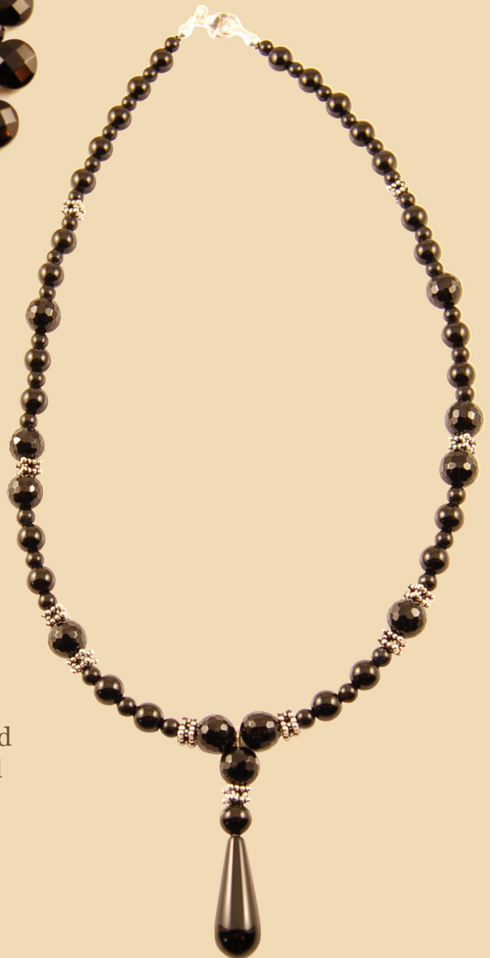
CN2 Black Onyx faceted beads with central drop and Sterling Silver £82