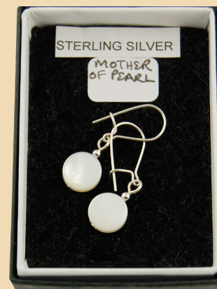
CE15 White Mother of Pearl single coin and Sterling Silver £19