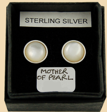
CS 3 Mother of Pearl large round and Sterling Silver £26