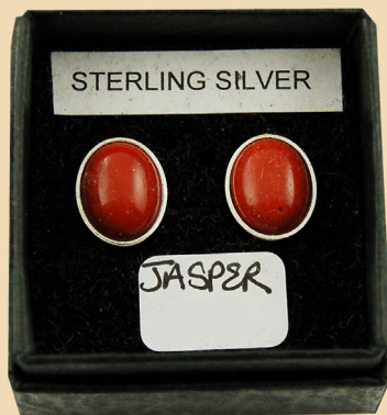
CS4 Red Jasper oval and Sterling Silver £28