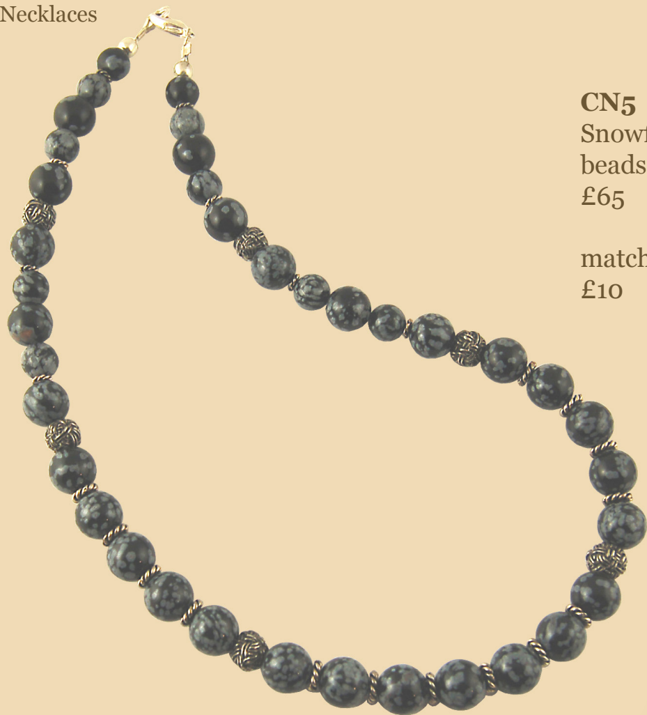
CN5 Snowflake Obsidian beads, silver-plated £65