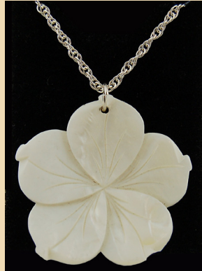
CP11 White Mother of Pearl flower and Sterling Silver £45