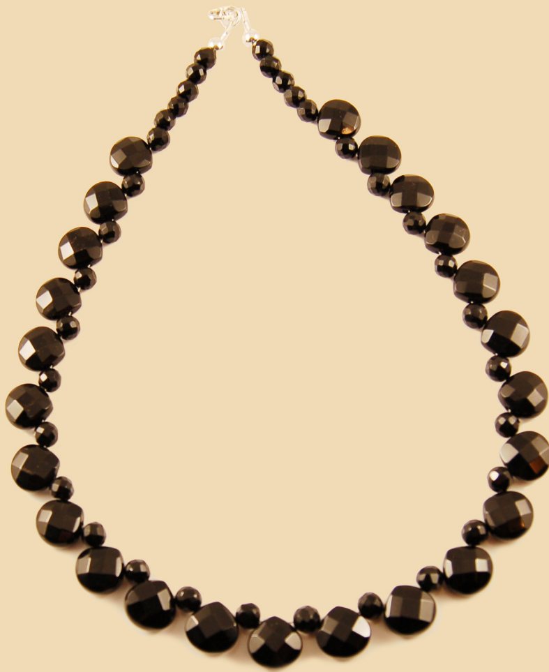
CN1 Black Onyx faceted drops and beads and Sterling Silver £102