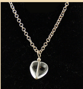
CP7 Rock Crystal heart and Sterling Silver £22