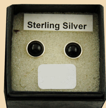
CS9 Black Onyx small round and Sterling Silver £24