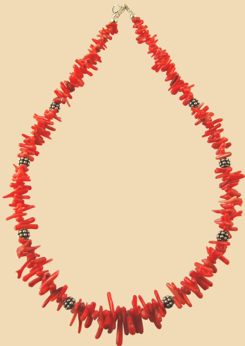
CN7 Red Branch Coral and Sterling Silver £92