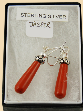
CE11 Red Jasper drops and Sterling Silver £27