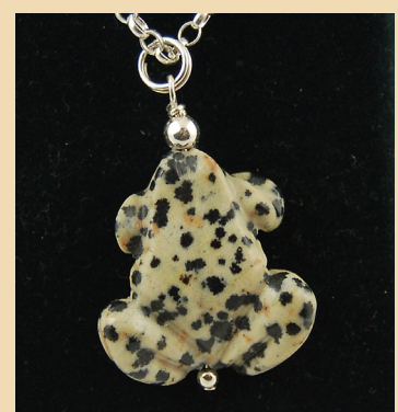
CP9 Dalmatian Jasper frog and Sterling Silver £45