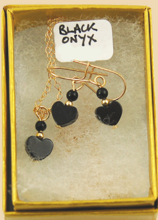
CSET1 Black Onyx hearts and Gold Filled, pendant and earrings £42