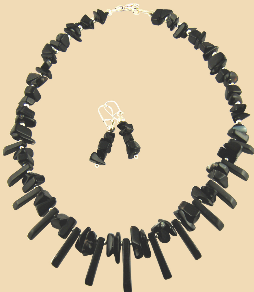
CN8 Black Onyx chips and spikes, silver-plated £65