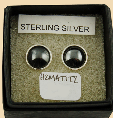
CS8 Hematite round and Sterling Silver £26