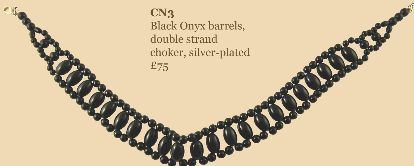
CN3 Black Onyx barrels, double strand choker, silver-plated £75