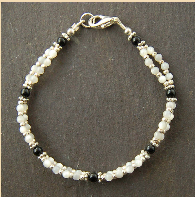
CB8 Mother of Pearl and Black Onyx beads, silver-plated double strand £42