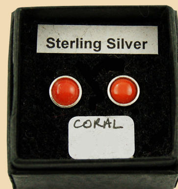
CS12 Red Coral round and Sterling Silver £25