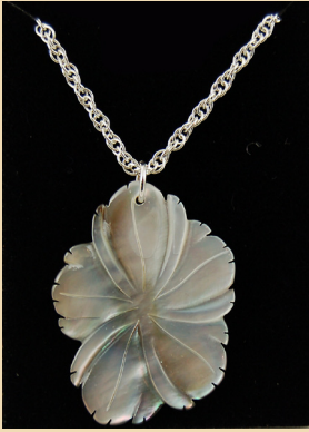
CP10 Black Mother of Pearl flower and Sterling Silver £45