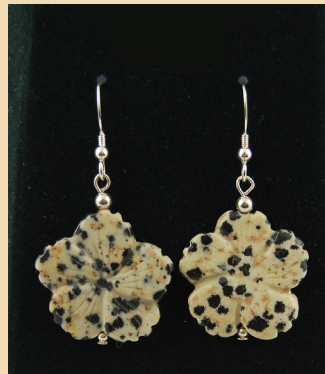
CE 8 Dalmation Jasper carved flowers and Sterling Silver £38