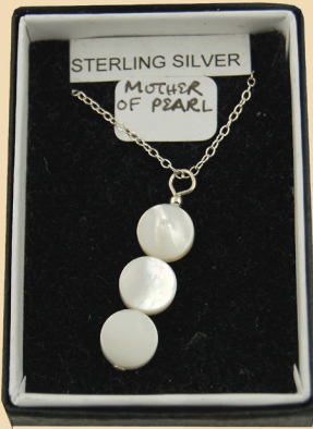
CP13 White Mother of Pearl triple coin and Sterling Silver £23