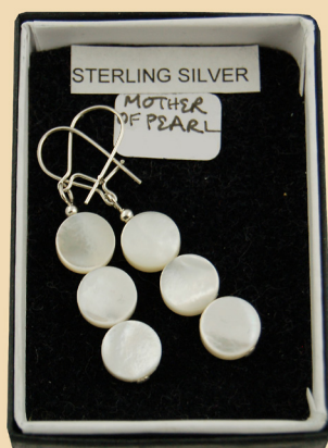
CE13 White Mother of Pearl triple coin and Sterling Silver £22