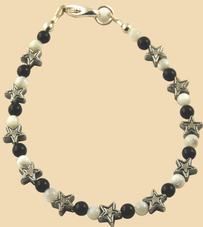
CB 7 Mother of Pearl and Black Onyx beads and silver- plated stars £35