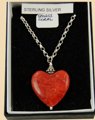
CP15 Sponge Coral large heart and Sterling Silver £35