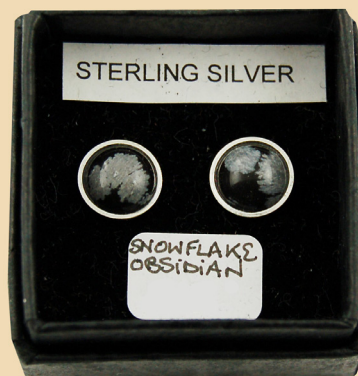
CS5 Snowflake Obsidian round and Sterling Silver £26