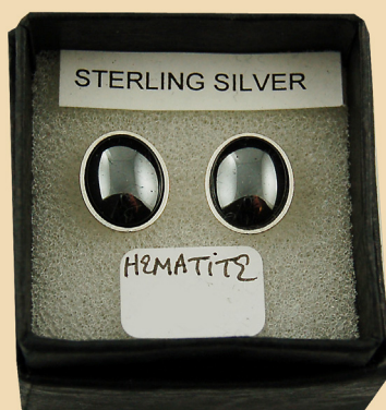
CS7 Hematite ovals and Sterling Silver £28