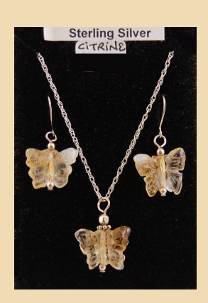
FSET3 Citrine butterflies and Sterling Silver pendant and earrings £48