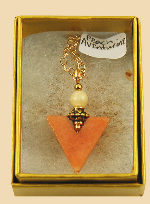
FP11 Peach Aventurine 'V' shape, gold-plated £15