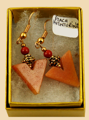
FE12 Peach Aventuringe 'V' shape and gold-plated £15