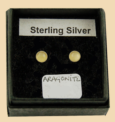
FS5 Aragonite small round and Sterling Silver £22