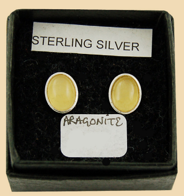
FS6 Aragonite oval and Sterling Silver £24