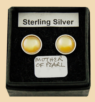
FS1 Gold Mother of Pearl round and Sterling Silver £26