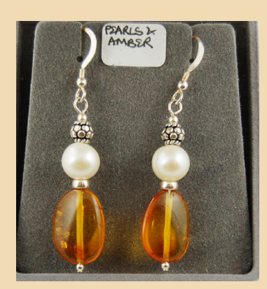
FE3 Amber and Freshwater Pearls and Sterling Silver £45