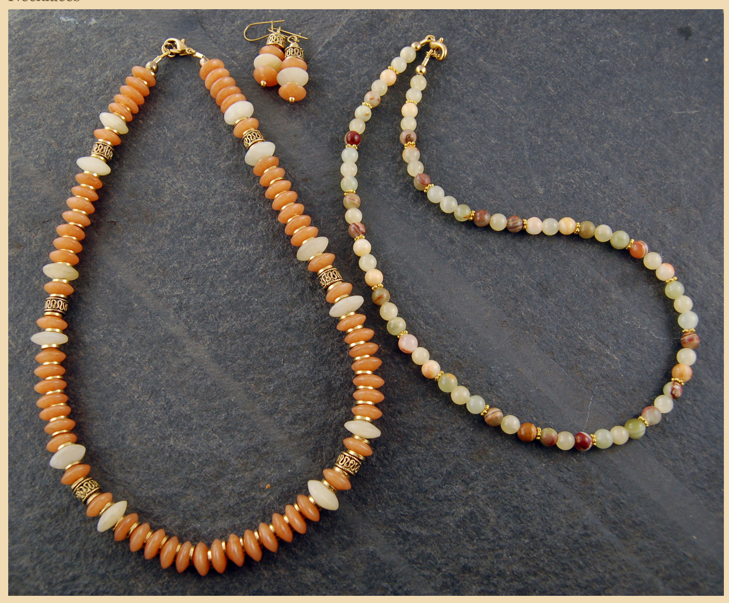
FN7 Peach Aventurine and Aragonite buttons gold-plated necklace £56