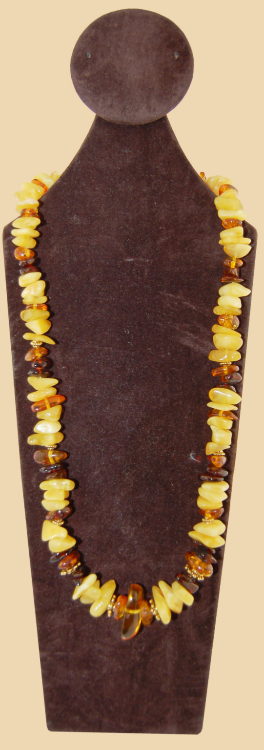
FN2 Cognac Amber nuggets, white Freshwater Pearls and Sterling Silver necklace (long)