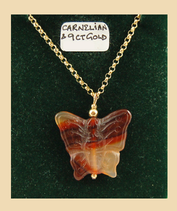
FP6 Carnelian butterfly and 9ct Gold £65