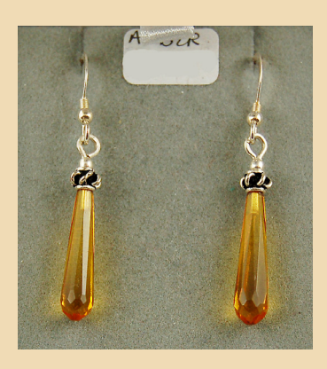
FE2 Faceted Amber drops and Sterling Silver £47