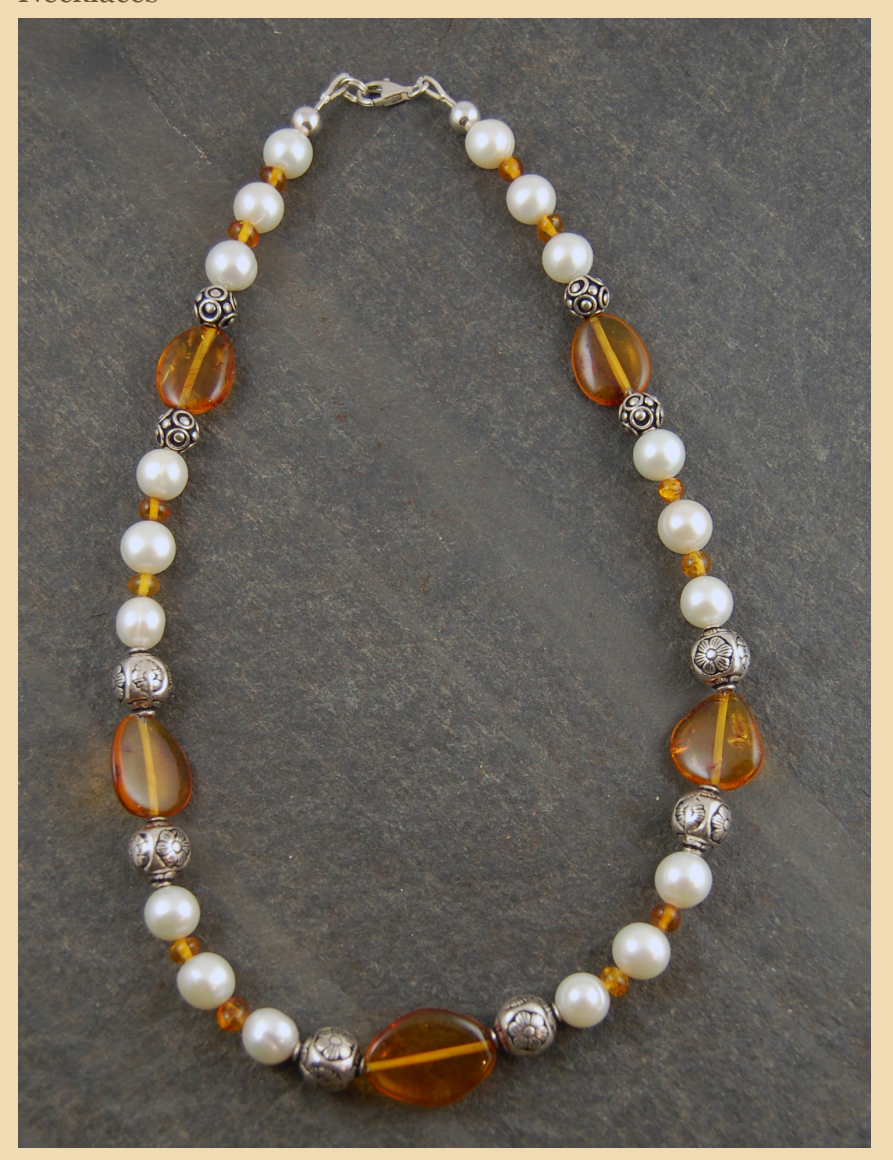
FN3 Honey Amber beads, white Freshwater Pearls and Sterling Silver necklace £165