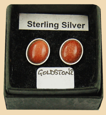
FS4 Goldstone oval and Sterling Silver £28