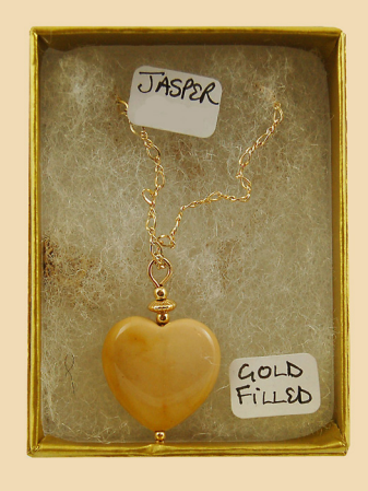
FP8 Yellow Jasper heart and Gold Filled £35