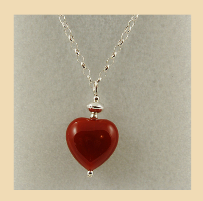
FP10 Dark Carnelian heart and Sterling Silver £30