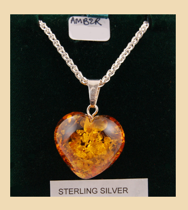
FP2 Large Amber heart and Sterling Silver £85