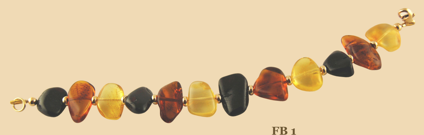
Multi-coloured Amber nuggets and 9ct Gold bracelet £125