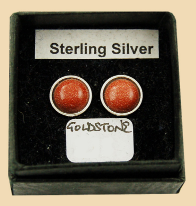
FS3 Goldstone round and Sterling Silver £26