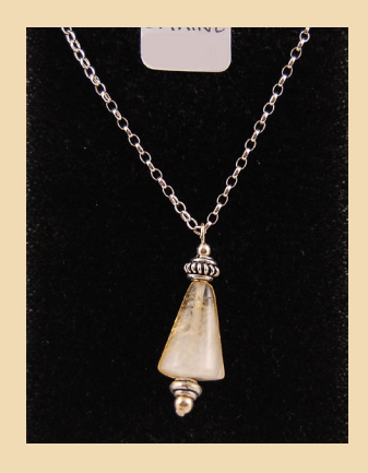
FP7 Citrine cone and Sterling Silver £30