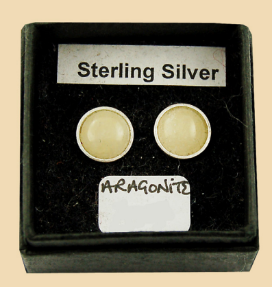
FS2 Aragonite round and Sterling Silver £26