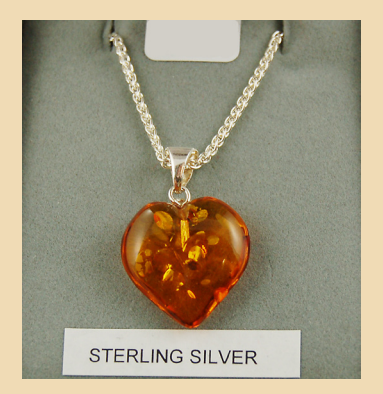
FP3 Medium Amber heart and Sterling Silver £60