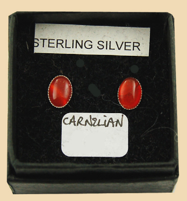
FS9 Red Carnelian small ovals and Sterling Silver £23