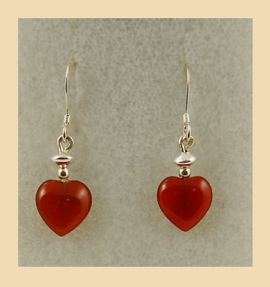
FE4 Carnelian hearts and Sterling Silver £26