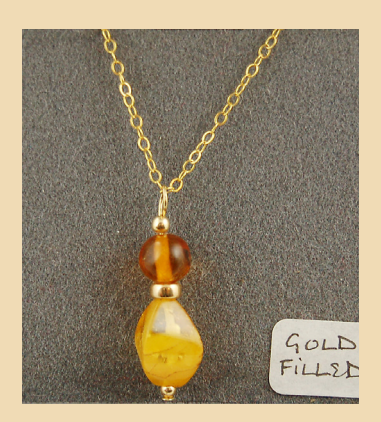
FP5 Butterscotch and Honey Amber and Gold Filled £45