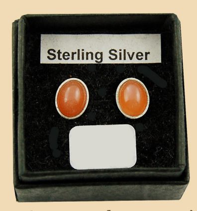
FS10 Peach Aventurine ovals and Sterling Silver £24