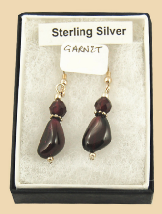
FE8 Garnet smooth nuggets and Sterling Silver £28