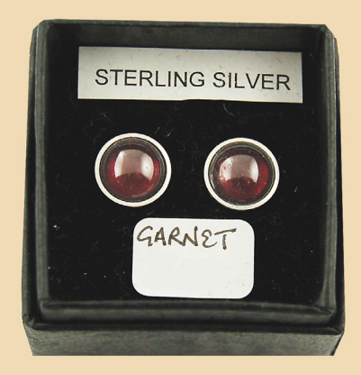
FS7 Garnet round and Sterling Silver £32