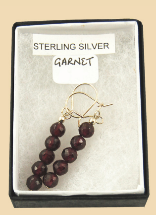
FE11 Garnet faceted beads and Sterling Silver (long) £25