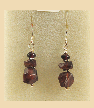
FE9 Garnet faceted nuggets and Sterling Silver £30