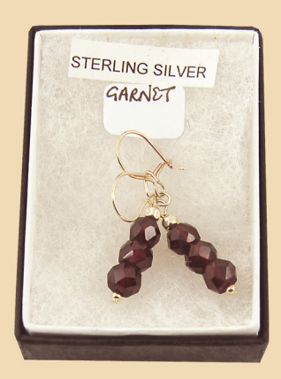
FE10 Garnet faceted beads and Sterling Silver £24