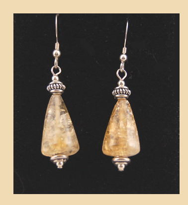
FE7 Citrine cones and Sterling Silver £30