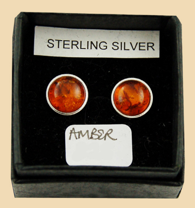
FS8 Amber round and Sterling Silver £38