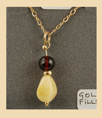
FP4 Butterscotch and Red Amber and Gold Filled £45