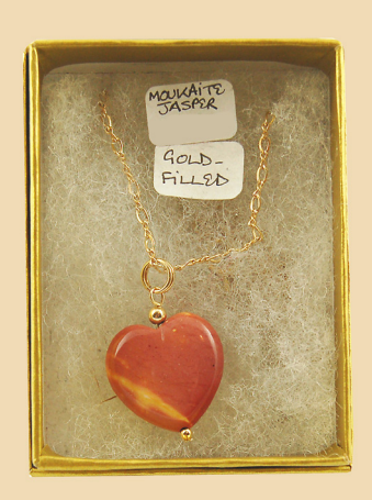
FP9 Moukite Jasper heart and Gold Filled £35