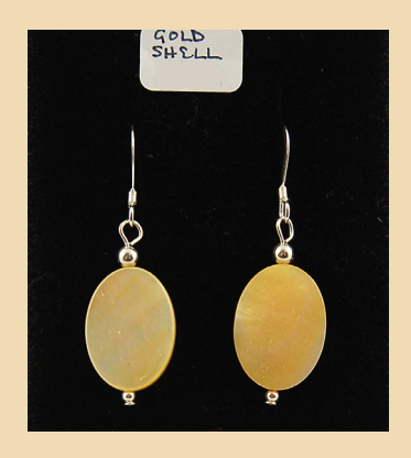
FE1 Gold Shell ovals and Sterling Silver £22