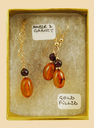
FSET2 Amber, Garnet and Gold Filled pendant and earrings £60