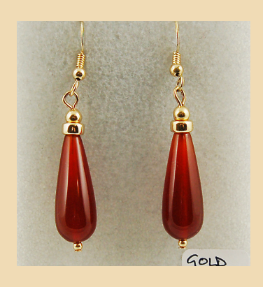
FE6 Dark Carnelian drops and Gold Filled £35