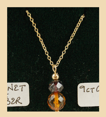
FP1 Garnet and Amber and 9ct Gold £65