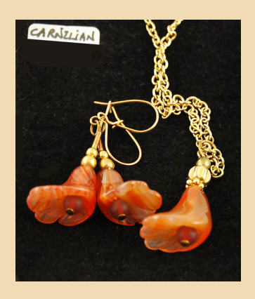
FSET4 Carnelian flowers and gold-plated pendant and earrings £26