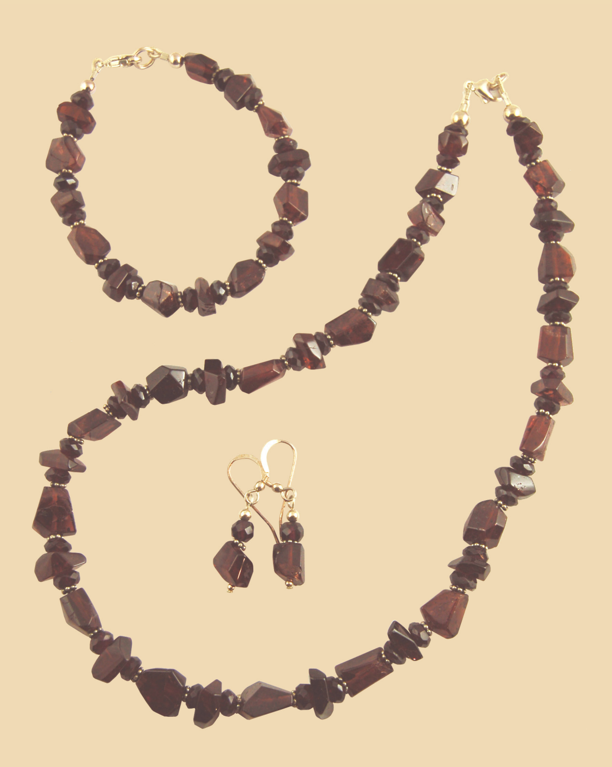
FSET 1 Garnet faceted nuggets and Sterling Silver necklace, bracelet and earrings £200