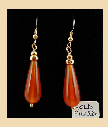
FE5 Light Carnelian drops and Gold Filled £35