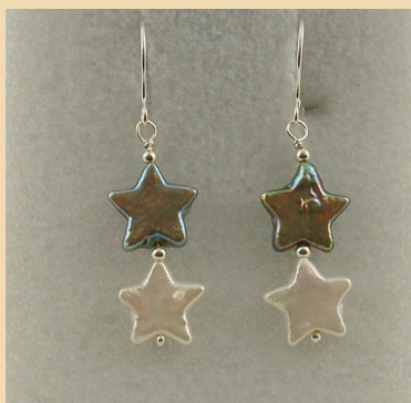
PE4 Grey and White star Pearls and Sterling Silver £40