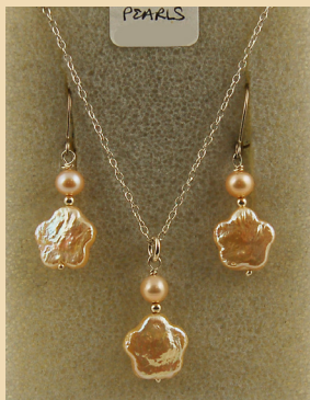
PSET 2 Creamy Peach Pearl flowers and Sterling Silver pendant and earrings £60