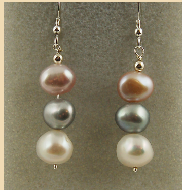
PE14 Pink, Grey and White large Pearls and Sterling Silver £35