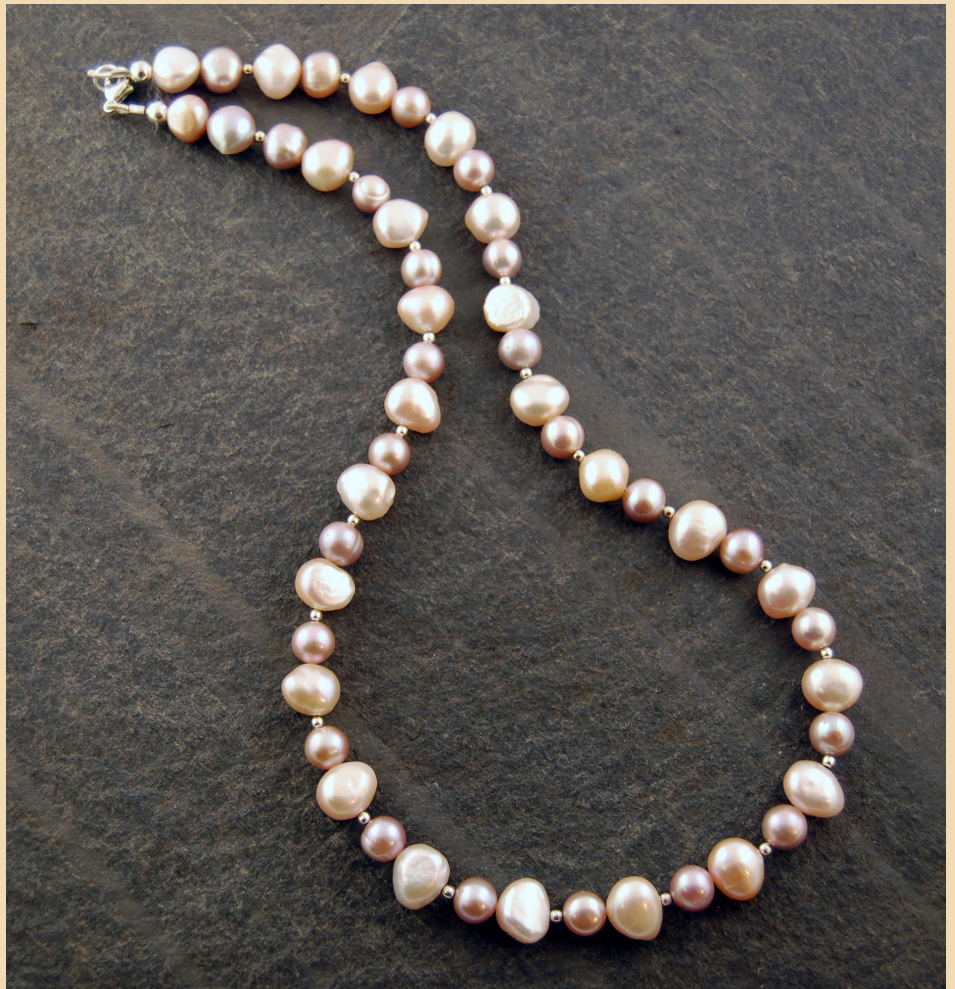
PN14 Natural Pink and Cream Pearls, two sizes, and Sterling Silver – long £105