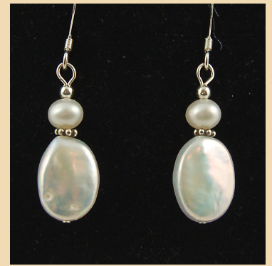
PE12 White oval coin Pearls and Sterling Silver £38