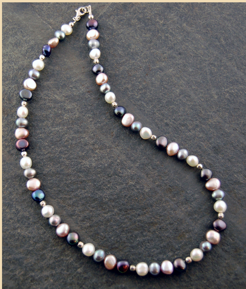
PN20 Pink, White, Grey and Black Pearls with faceted Sterling Silver beads £87