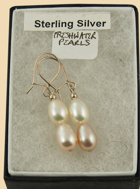
PE19 Mixed coloured Pearls and Sterling Silver £20-25