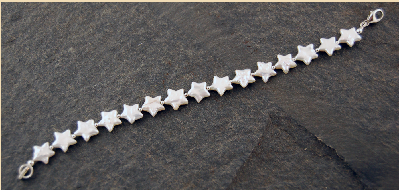
PB4 White star Pearls and Sterling Silver £58