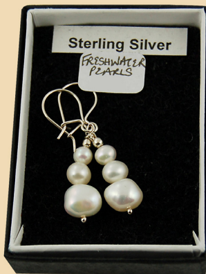
PE29 Mixed coloured Pearls and Sterling Silver £20-25