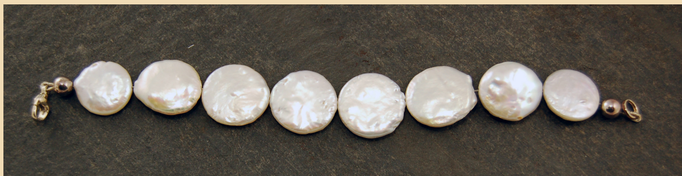
PB 1 Large Natural White coin Pearls and Sterling Silver £ 80