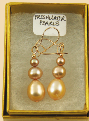
PE32 Mixed Gold coloured Pearls with 9ct Gold £55-65