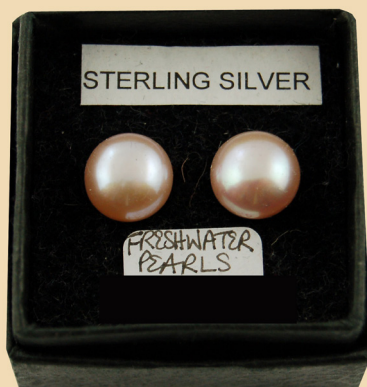
PS5 Various colours and sizes and Sterling Silver £28-65