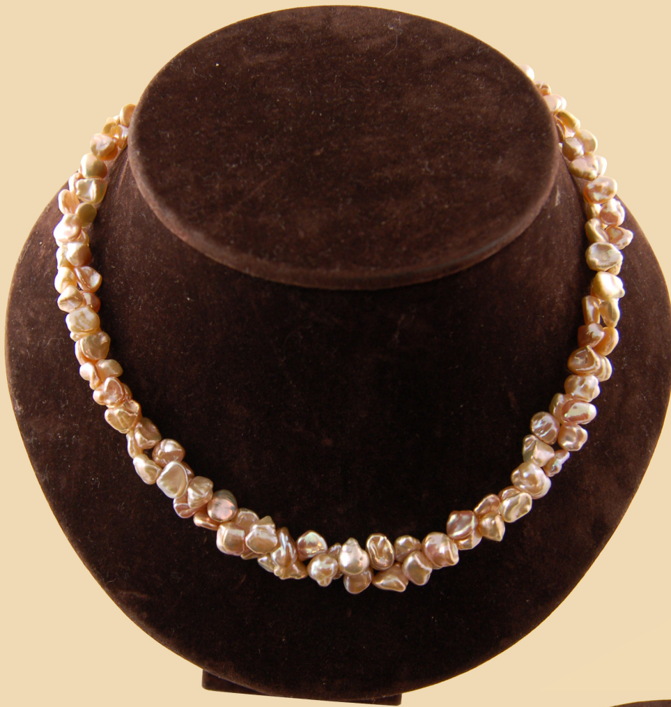
PN 5 Natural Peach Keshi twist and Sterling Silver £150