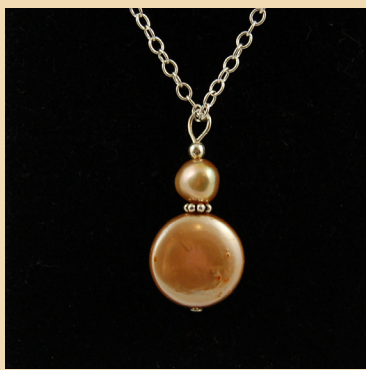
PP1 Gold coin Pearl and Sterling Silver £38