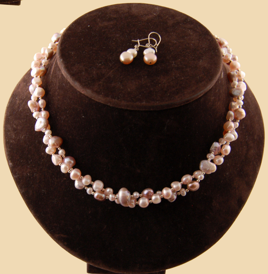
PN 6 Natural Pinks and Creams Pearl twist and Sterling Silver £110