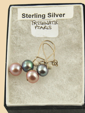
PE27 Mixed coloured Pearls and Sterling Silver £20-25