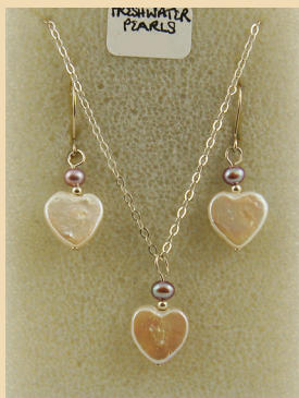
PSET 1 White heart Pearls and Sterling Silver, pendant and earrings £60