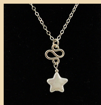
PP3 White star Pearl with Sterling Silver squiggle £45