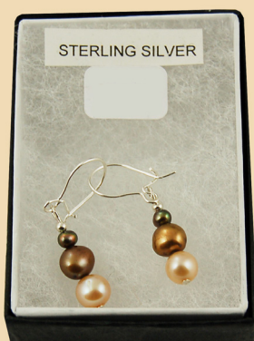
PE16 Mixed coloured Pearls and Sterling Silver £20-25