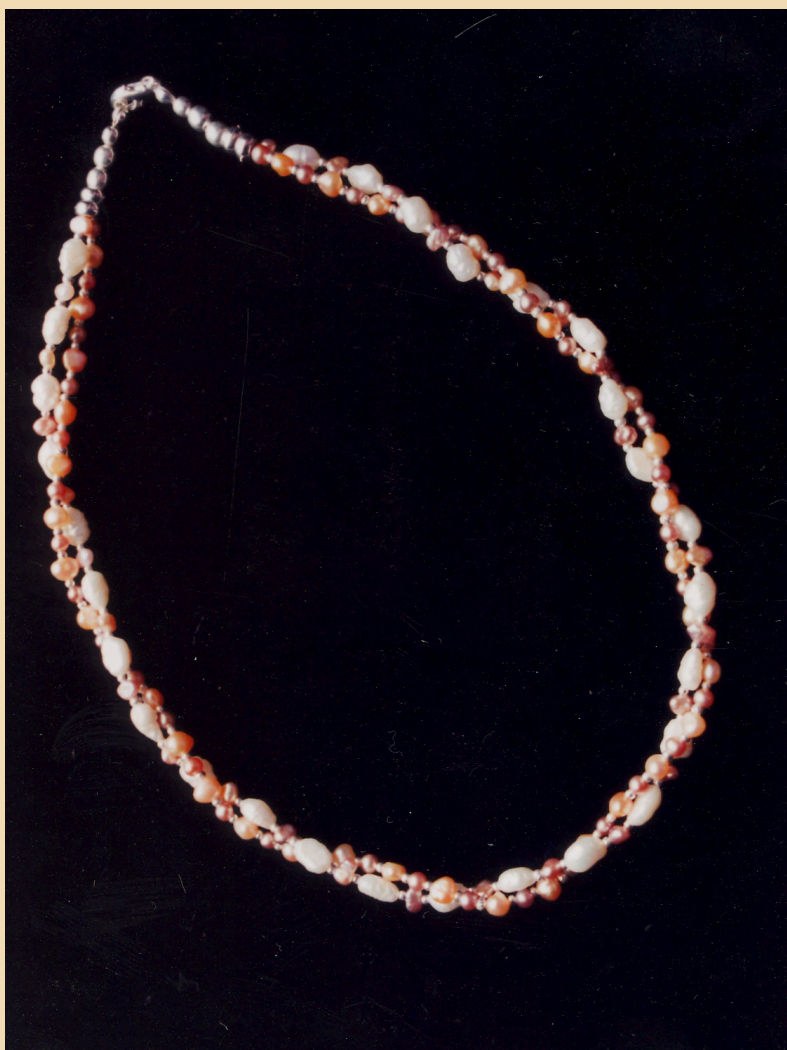
PN22 Natural Peach and Cream Pearls and Sterling Silver, twisted £90