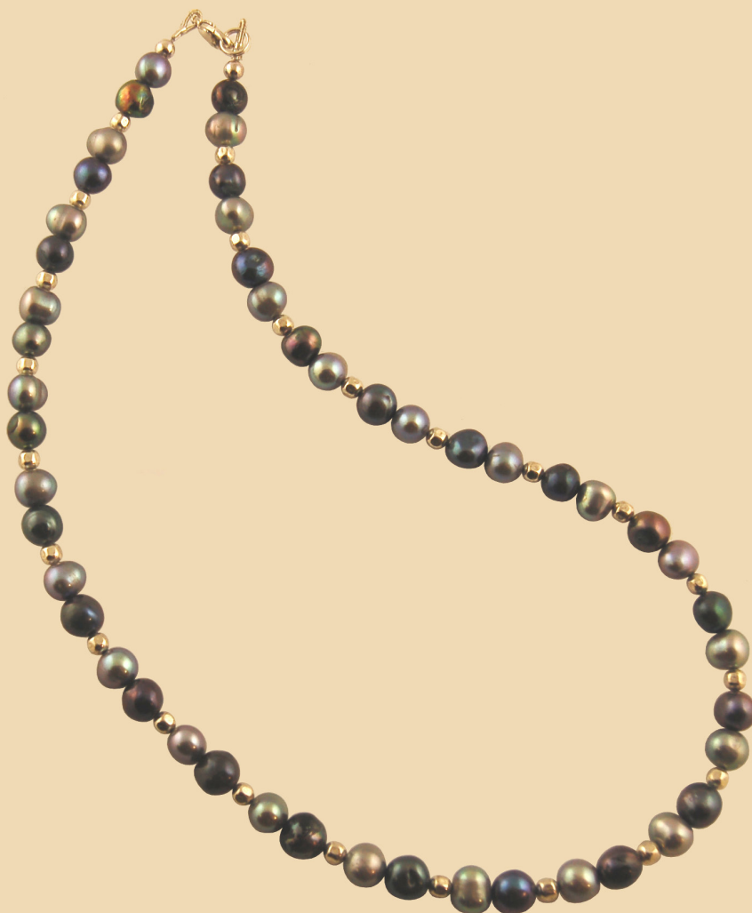
PN16 Black and Grey Pearls with faceted Sterling Silver beads £82