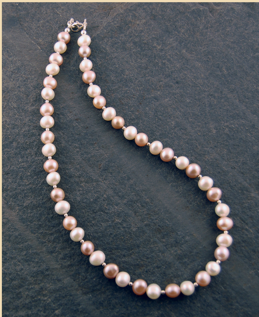
PN17 Natural Peach and White Pearls with faceted Sterling Silver beads £86