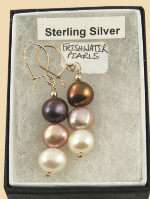
PE25 Mixed coloured Pearls and Sterling Silver £20-25