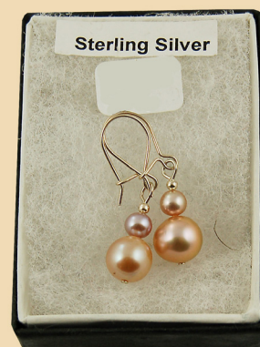
PE21 Mixed coloured Pearls and Sterling Silver £20-25