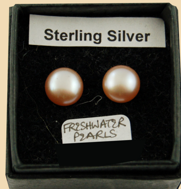
PS6 Various colours and sizes and Sterling Silver £28-65