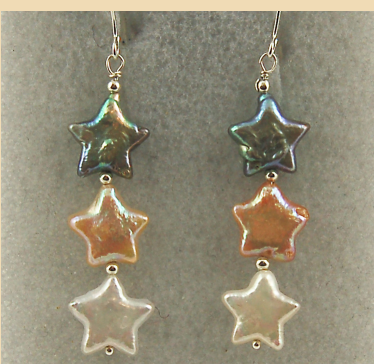
PE5 Pink, Grey and White star Pearls and Sterling Silver £43