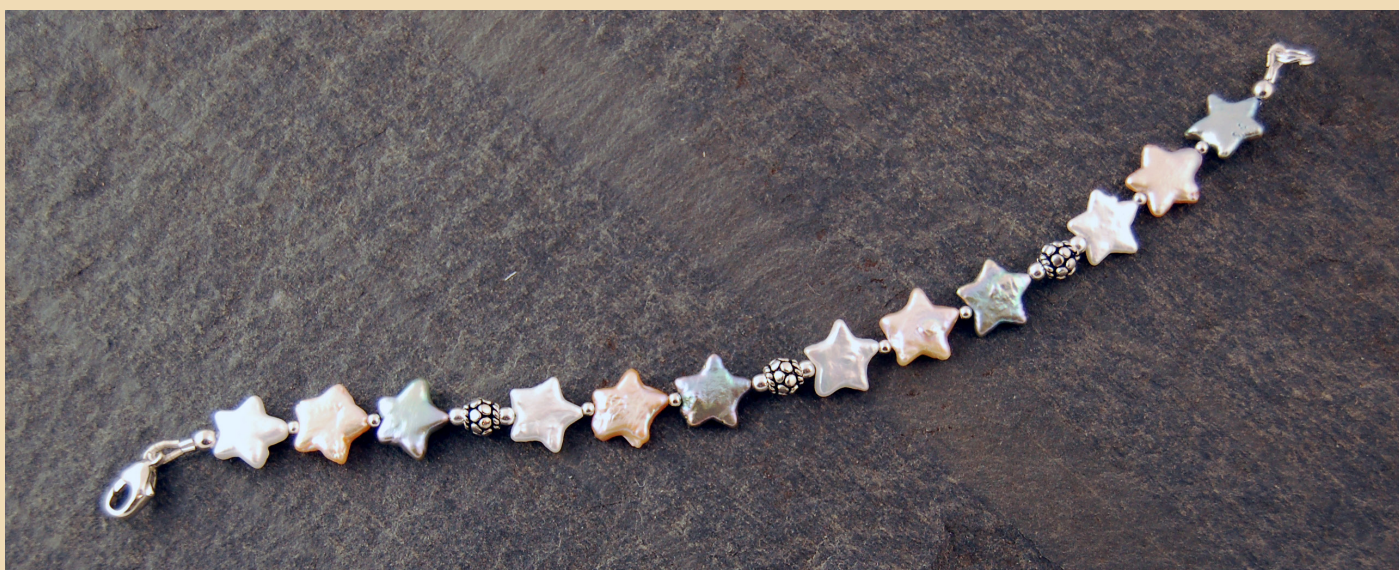
PB5 White, Pink and Grey star Pearls and Sterling Silver £65