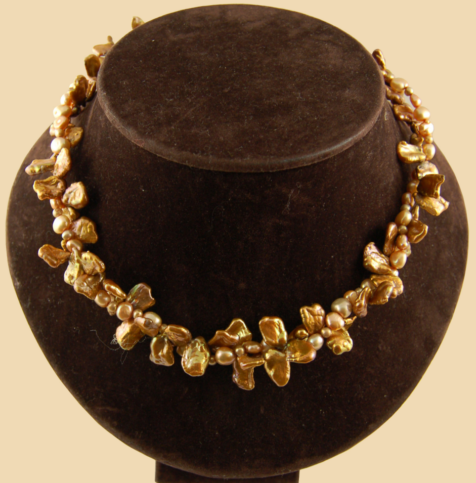
PN 2 Gold Keshi and nugget twist and Sterling Silver £180