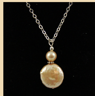
PP6 Natural Pink coin Pearl with Sterling Silver squiggle £36