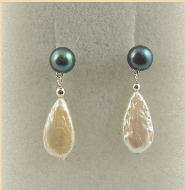
PE13 White Pearl teardrops with Black Pearls and Sterling Silver £80