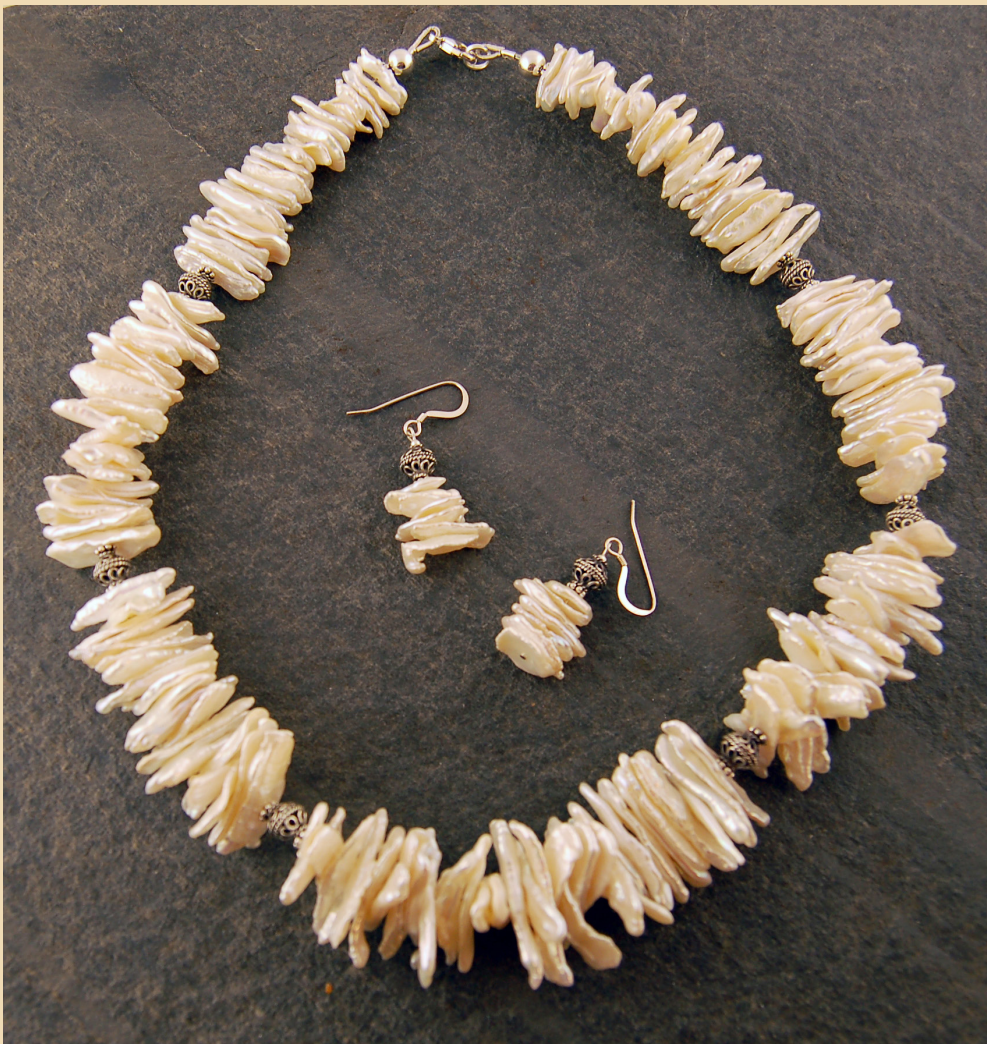
PN 9 Natural White Fringe Pearls and Sterling Silver £180

matching earrings (not sold separately) £30