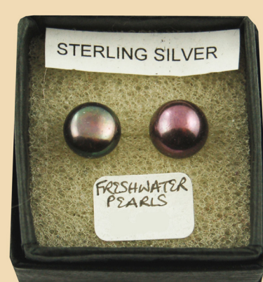
PS9 Various colours and sizes and Sterling Silver £28-65