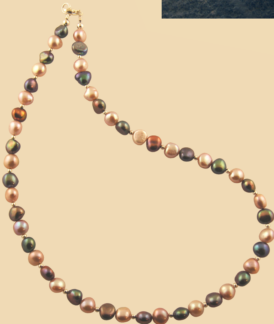
PN18 Pink and Black Pearls with frosted Sterling Silver beads £78