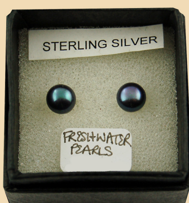
PS8 Various colours and sizes and Sterling Silver £28-65