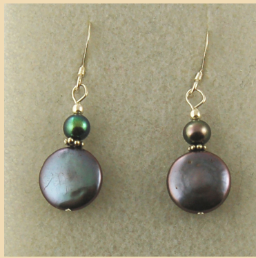
PE11 Black/Peacock coin Pearls and Sterling Silver £38