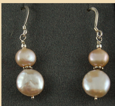
PE8 Natural Pink coin Pearls and Sterling Silver £38