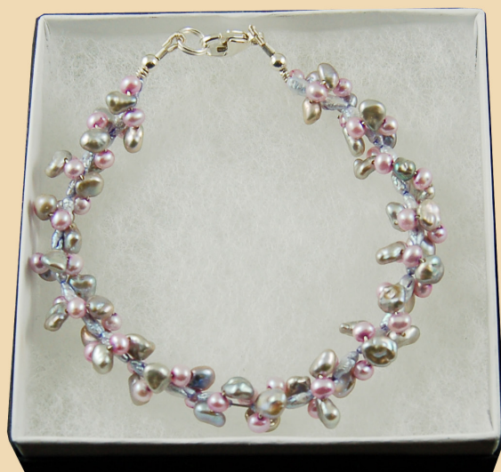
PB 8 Pink and Lavender interwoven Pearls and Sterling Silver £85