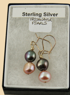
PE26 Mixed coloured Pearls and Sterling Silver £20-25