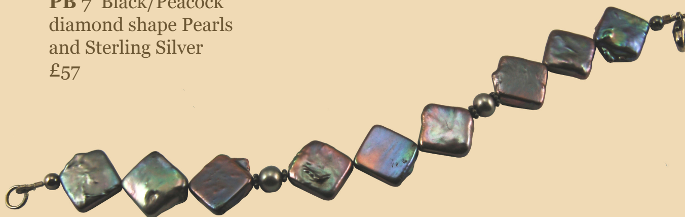
PB 7 Black/Peacock diamond shape Pearls and Sterling Silver £57