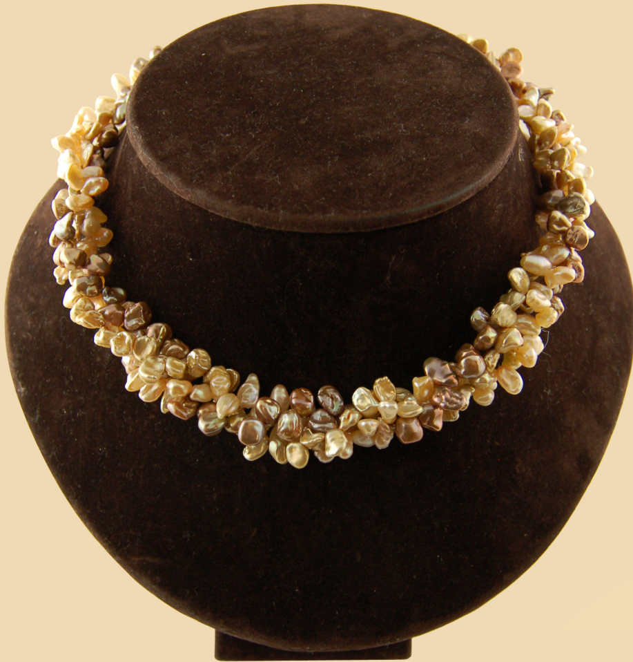
PN 1 Gold, Coffee and Cream Keshi Pearls triple twist and Sterling Silver £180