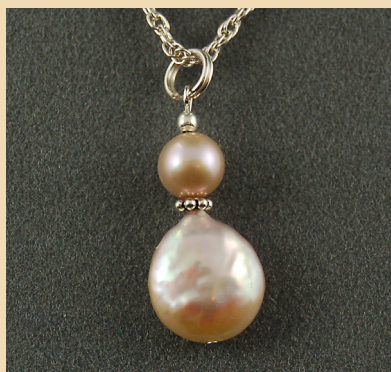
PP5 Natural Pink coin Pearl and Sterling Silver £40