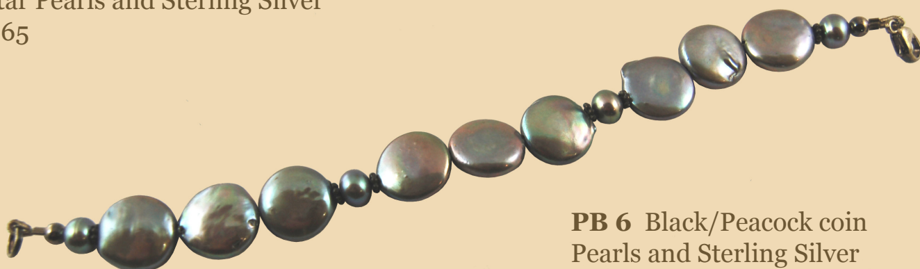
PB 6 Black/Peacock coin Pearls and Sterling Silver £53