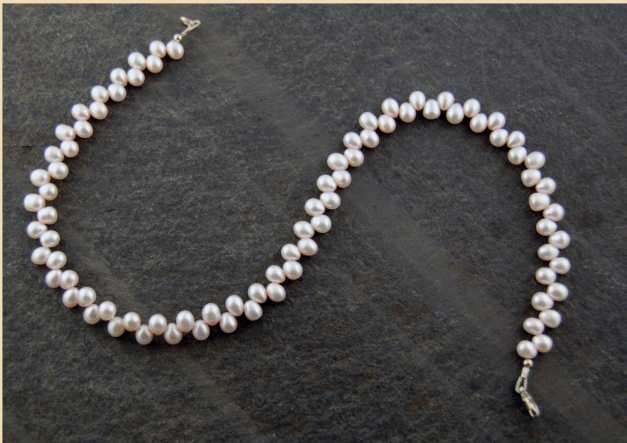
PN21 Natural Pale Pink Pearl choker and Sterling Silver £84