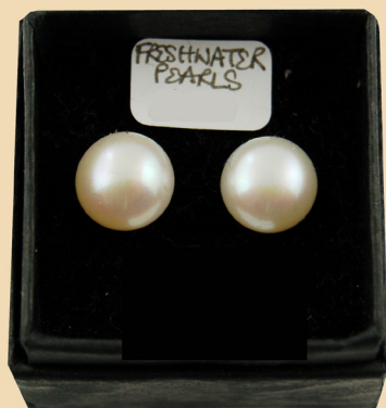
PS1 Large White Freshwater Pearls and 9ct Gold £75