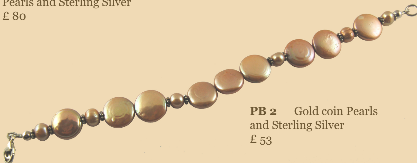
PB 2 Gold coin Pearls and Sterling Silver £ 53