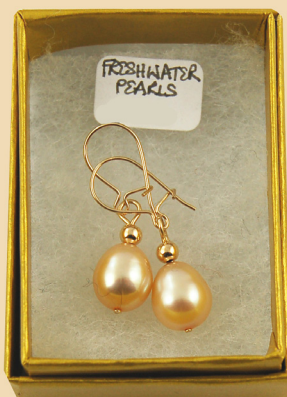
PE31 Mixed Gold coloured Pearls with 9ct Gold £55-65