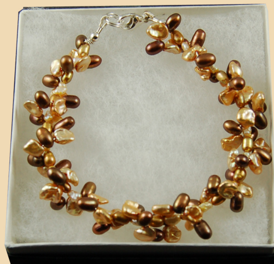
PB9 Gold and Brown interwoven Pearls and Sterling Silver £85