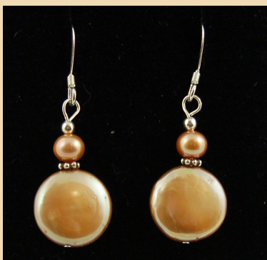
PE2 Gold coin Pearls and Sterling Silver £38