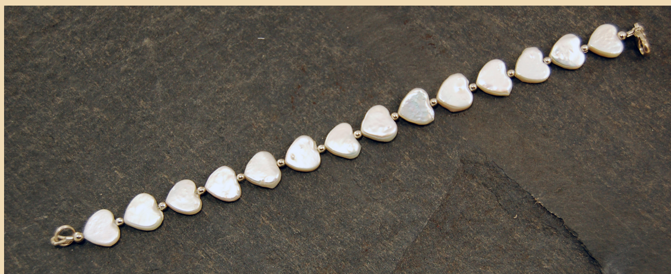
PB 3 White heart Pearls and Sterling Silver £ 58