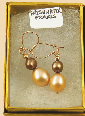
PE33 Mixed Gold coloured Pearls with 9ct Gold £55-65