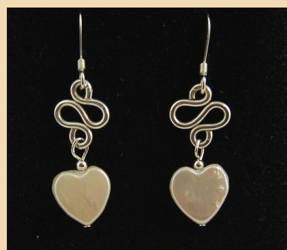
PE3 White heart Pearls with Sterling Silver squiggles £55