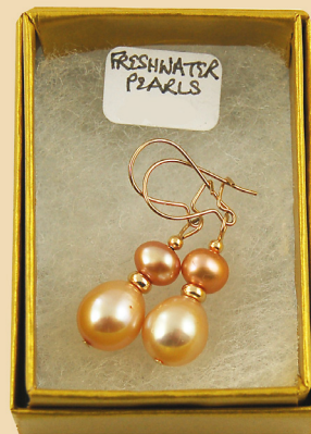
PE30 Mixed Gold coloured Pearls with 9ct Gold £55-65