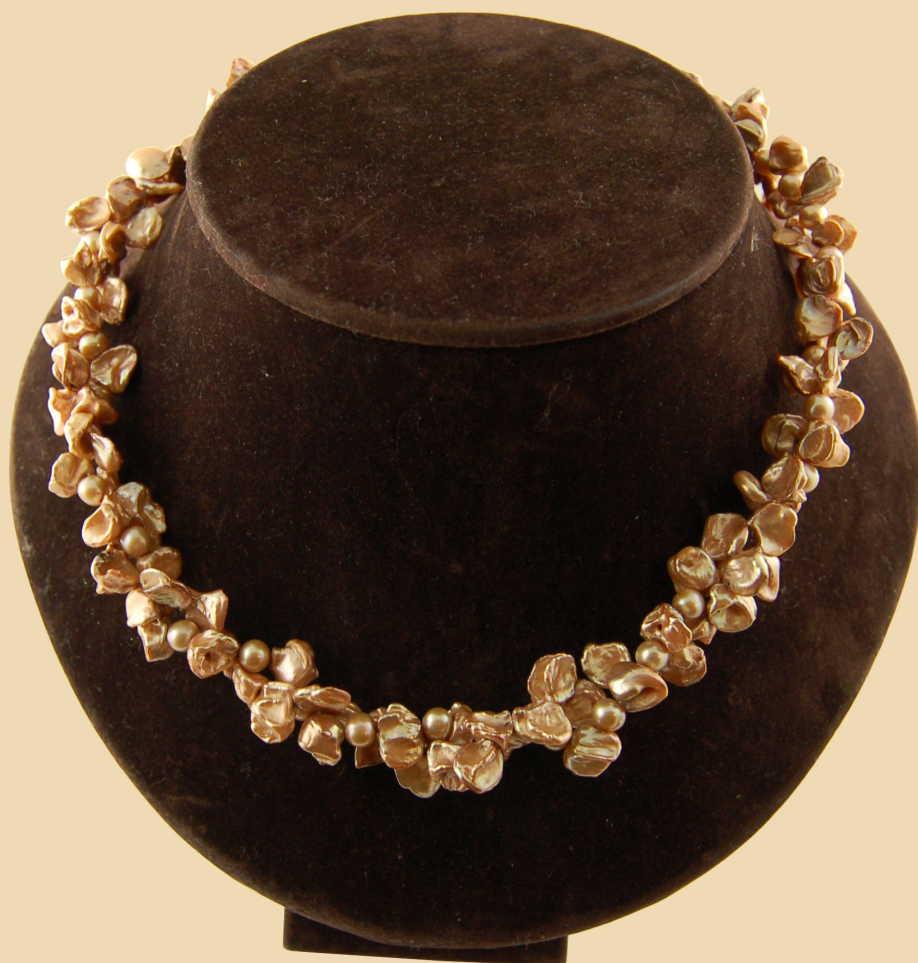
PN3 Butterscotch Keshi and round Pearl twist and Sterling Silver £165