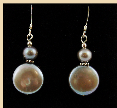
PE9 Silver coin Pearls and Sterling Silver £38