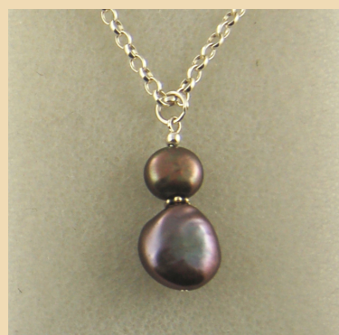
PP8 Black/Peacock coin Pearl and Sterling Silver £38