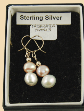
PE17 Mixed coloured Pearls and Sterling Silver £20-25