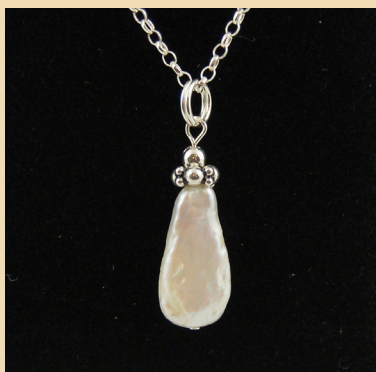
PP4 White teardrop Pearl and Sterling Silver £42