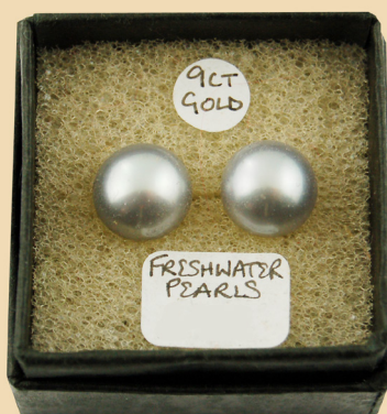
PS2 Large Grey Freshwater Pearls and 9ct Gold £75