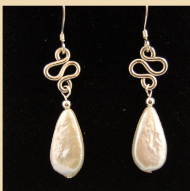
PE7 White Pearl teardrops with Sterling Silver squiggle £62