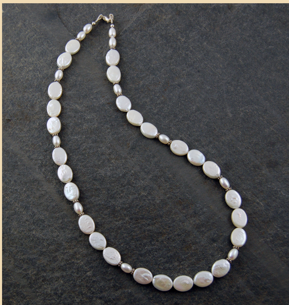
PN12 White oval coin Pearls and Sterling Silver £110