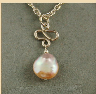
PP7 Pale Gold coin Pearl and Sterling Silver £45