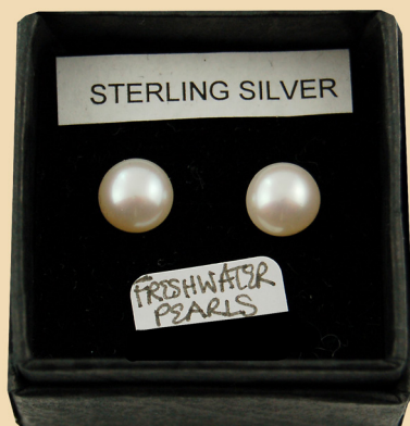
PS4 Various colours and sizes and Sterling Silver £28-65