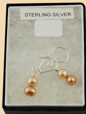
PE22 Mixed coloured Pearls and Sterling Silver £20-25