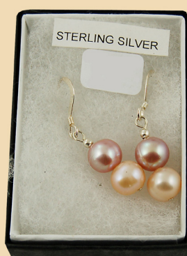
PE23 Mixed coloured Pearls and Sterling Silver £20-25