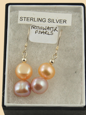
PE20 Mixed coloured Pearls and Sterling Silver £20-25