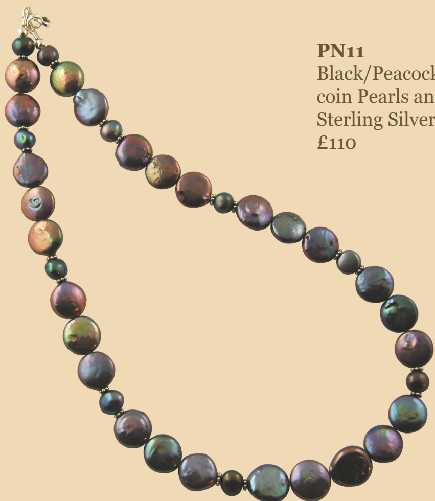
PN11 Black/Peacock coin Pearls and Sterling Silver £110