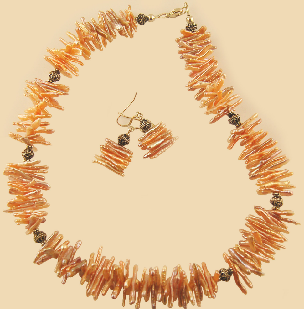
PN10 Natural Pink Fringe Pearls and Sterling Silver £160

matching earrings (not sold separately) £30