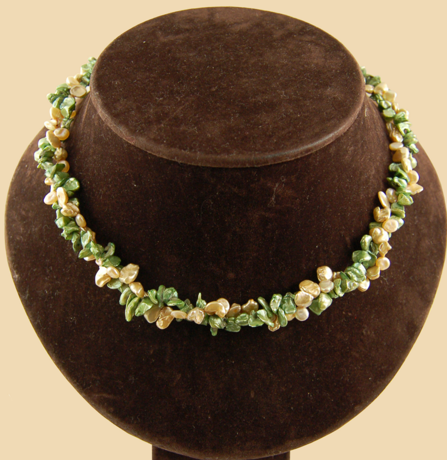
PN7 Green and Gold Keshi twist and Sterling Silver £120