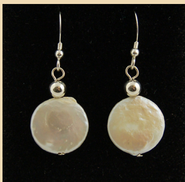
PE1 Large White coin Pearls and Sterling Silver £46