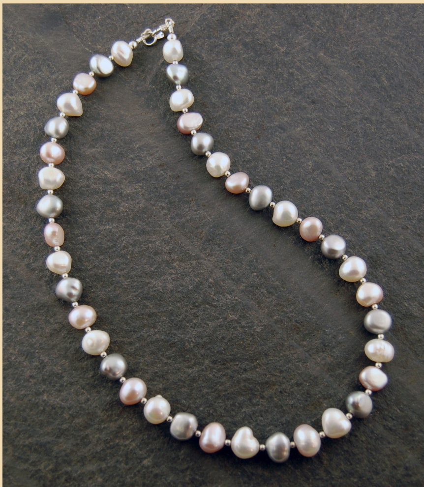
PN15 Large irregular Pearls, Pink, White and Grey and Sterling Silver £105