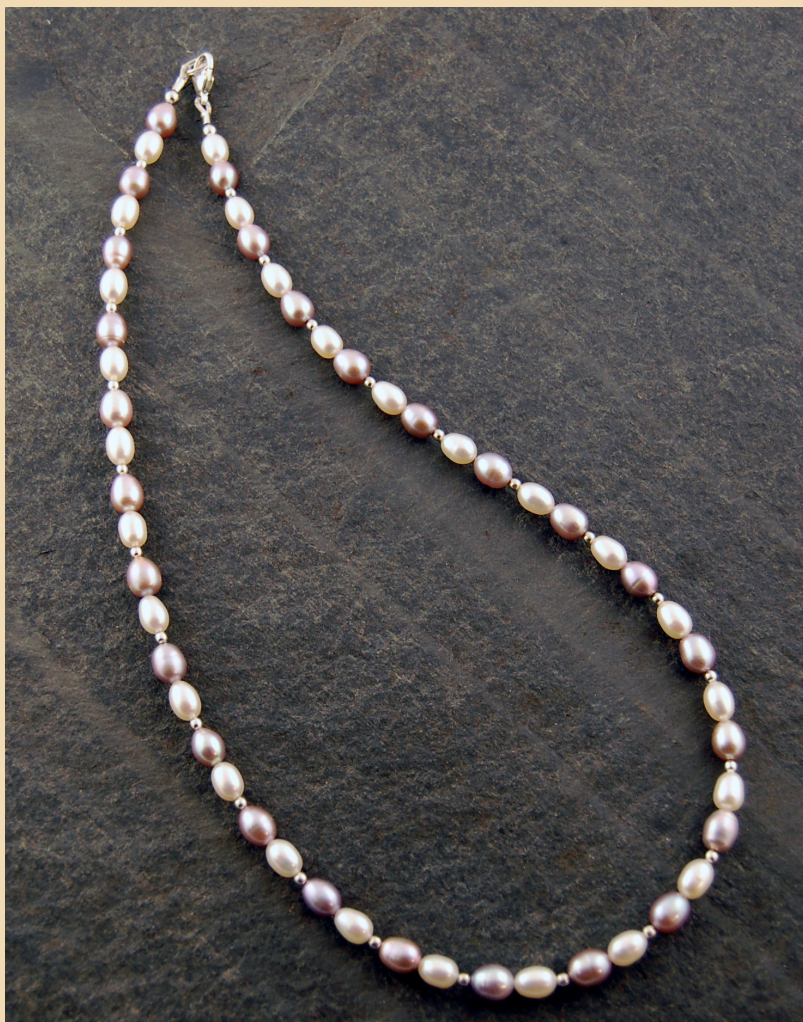
PN19 Natural Pink and White rice Pearls and Sterling Silver £78