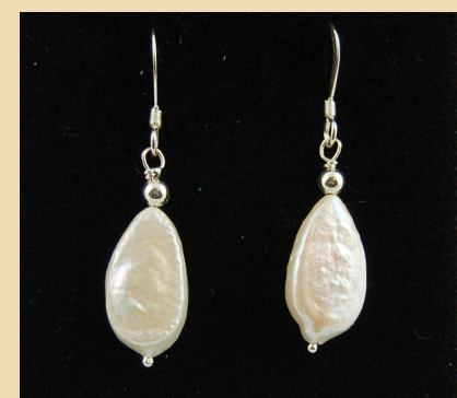
PE6 White Pearl teardrops and Sterling Silver £52