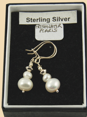
PE28 Mixed coloured Pearls and Sterling Silver £20-25