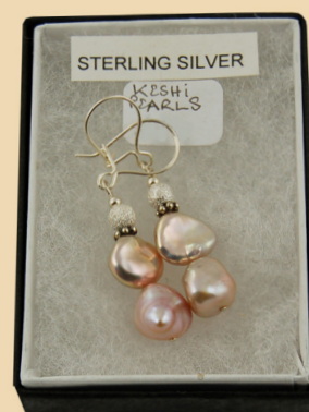
PE24 Mixed coloured Pearls and Sterling Silver £20-25