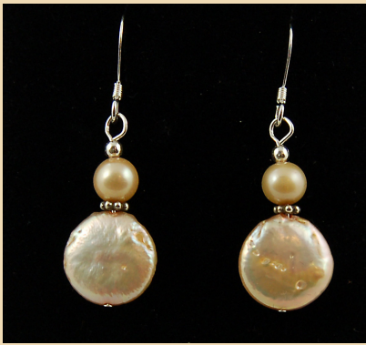
PE10 Pale Gold coin Pearls and Sterling Silver £36