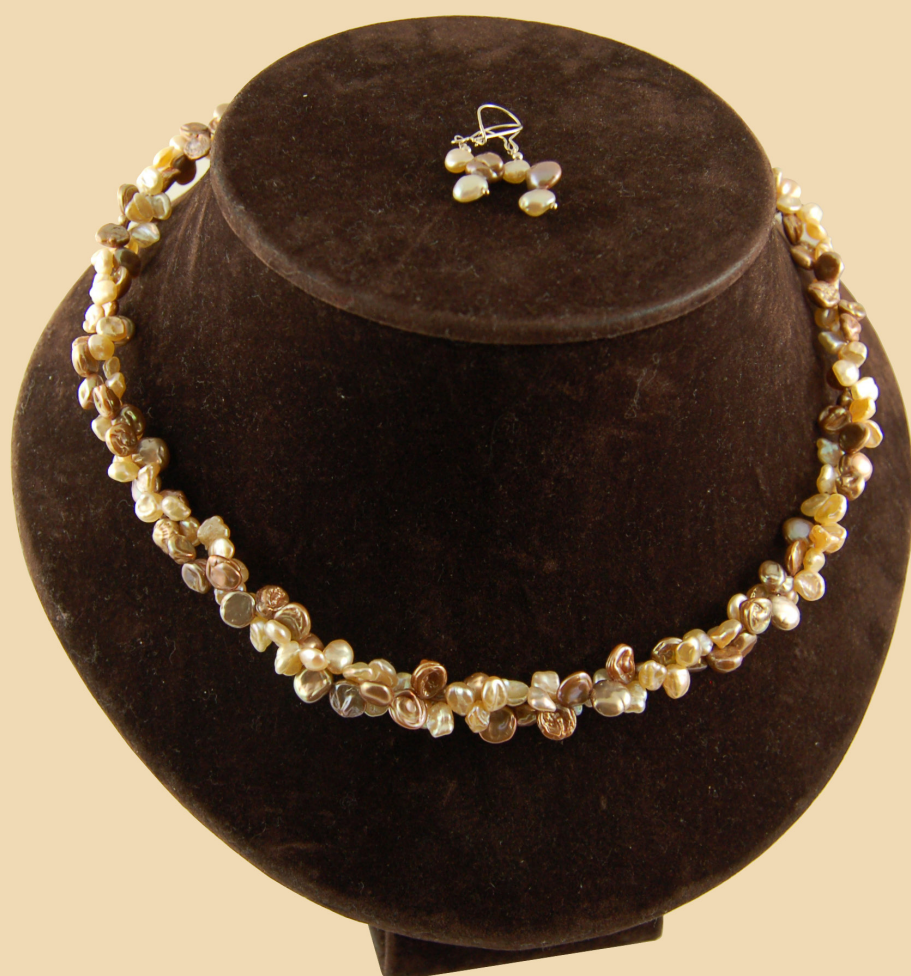
PN 4 Coffee and Cream Keshi twist and Sterling Silver £110