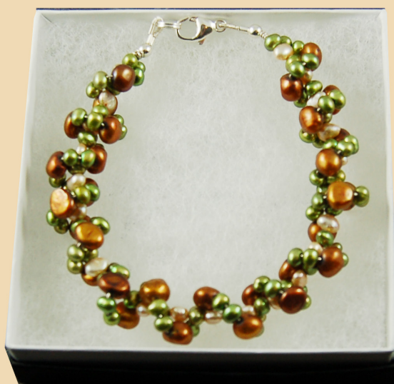
PB10 Green and Brown interwoven Pearls and Sterling Silver £85