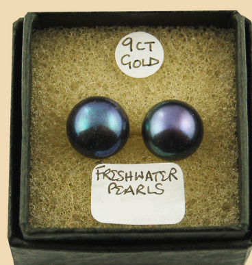
PS3 Large Black/Peacock Freshwater Pearls and 9ct Gold £75