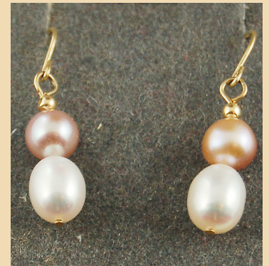
PE15 Natural Pink and Cream Pearls with 9ct Gold £60