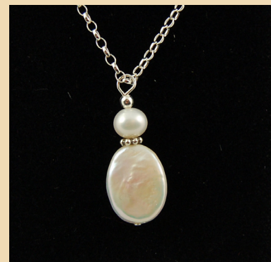
PP9 White oval coin Pearl and Sterling Silver £38