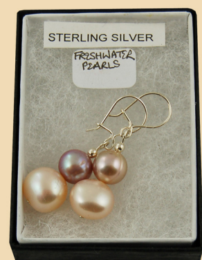
PE18 Mixed coloured Pearls and Sterling Silver £20-25