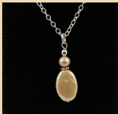
PP2 Cream oval coin Pearl and Sterling Silver £36