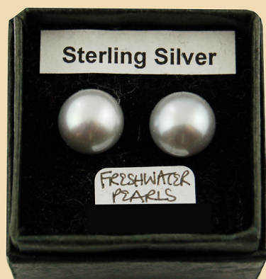
PS7 Various colours and sizes and Sterling Silver £28-65