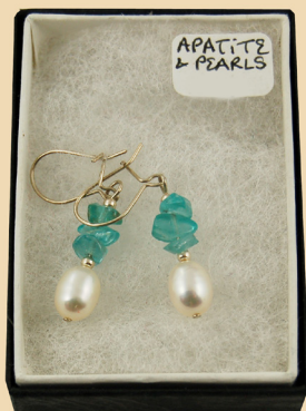
WE13 Apatite chips, white Freshwater Pearls and Sterling Silver £22