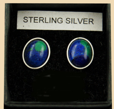
WS9 Azurite oval and Sterling Silver £28