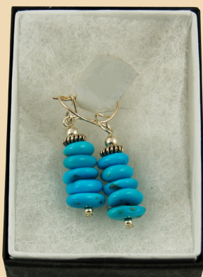
WE16 Turquoise buttons and Sterling Silver £22