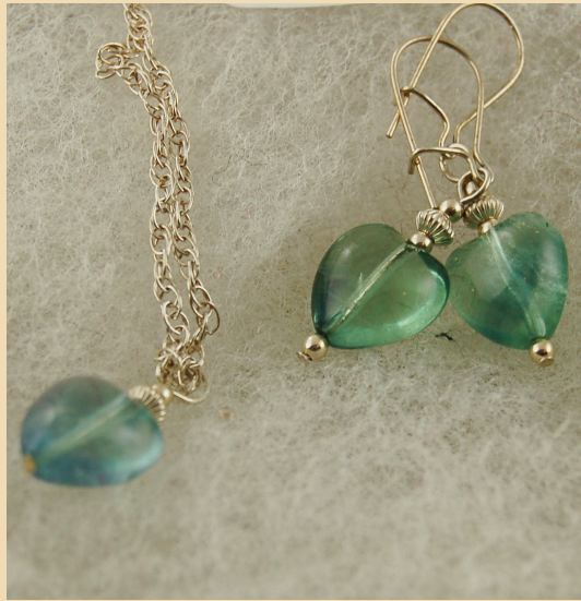
WSET 2 Fluorite blue hearts and Sterling Silver pendant and earrings £40