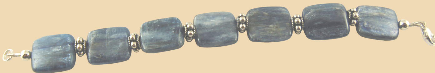
WB5 Kyanite rectangles and Sterling Silver £54