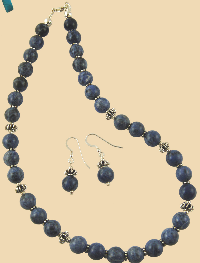
WN8 Sodalite beads and Sterling Silver £80