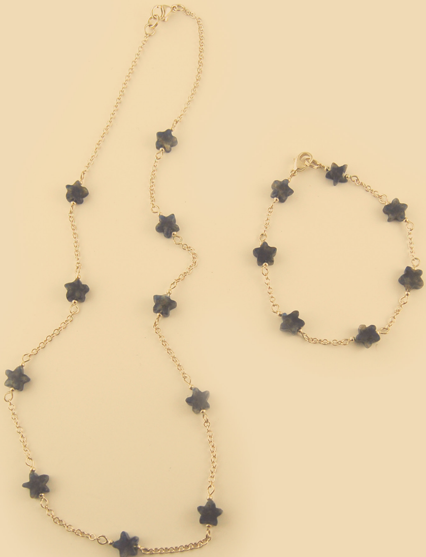
WSET 3 Sodalite stars on Sterling Silver chain necklace and bracelet £85