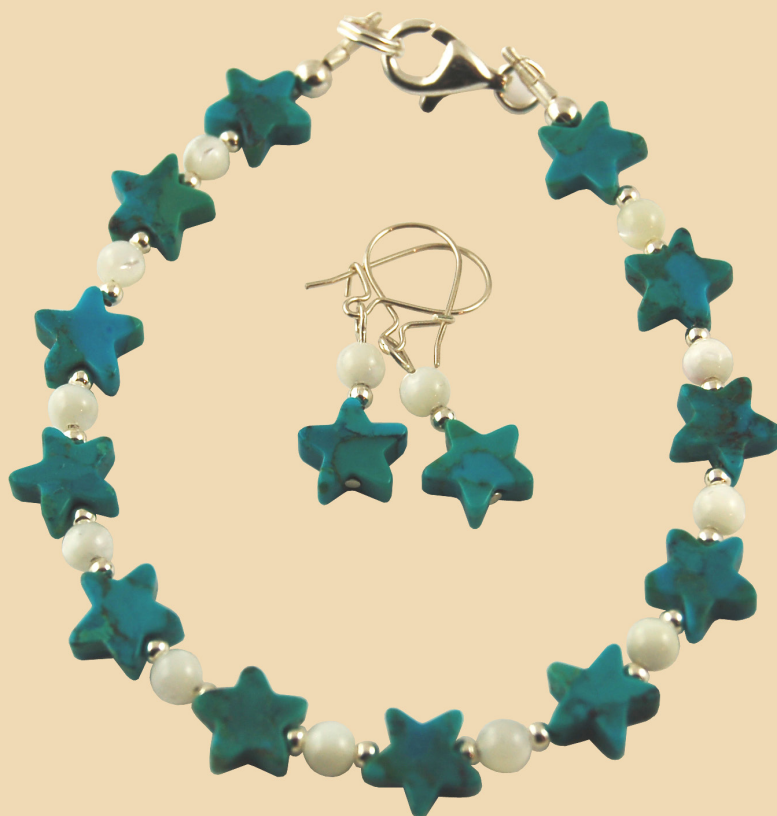
WB10 Turquoise stars and Mother of Pearl beads with Sterling Silver and matching earrings – SET £65