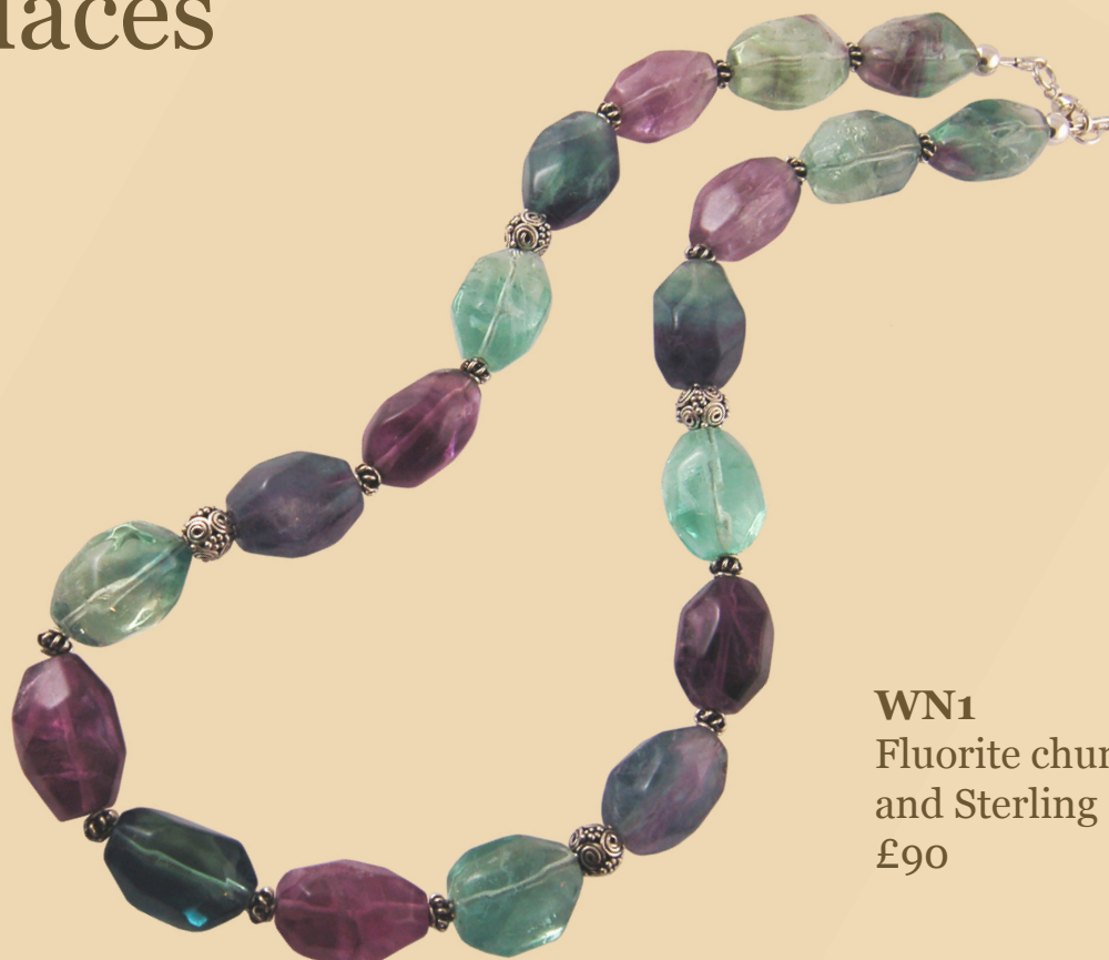
WN1 Fluorite chunks and Sterling Silver £90