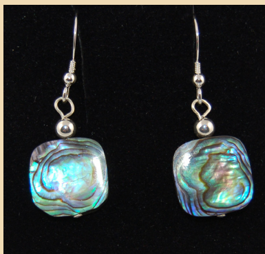
WE11 Paua Shell squares and Sterling Silver £25