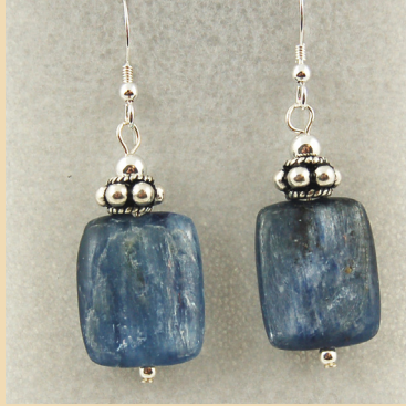
WE5 Kyanite rectangles and Sterling Silver £36