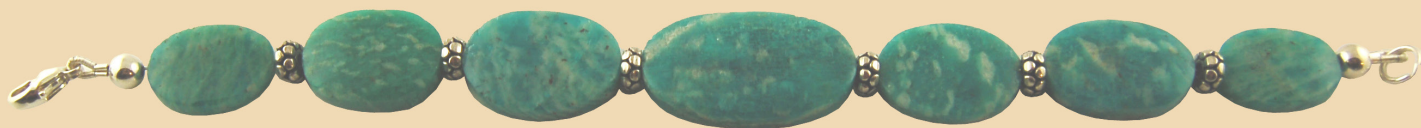
WB4 Amazonite ovals and Sterling Silver £52