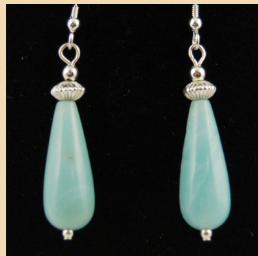
WE 8 Amazonite drops and Sterling Silver £30