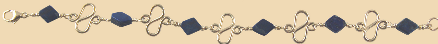
WB6 Lapis Lazuli diamonds with Sterling Silver hammered squiggles £75