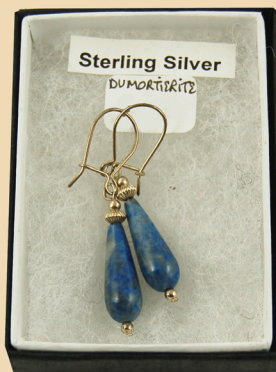
WE14 Dumortierite small drops and Sterling Silver £22