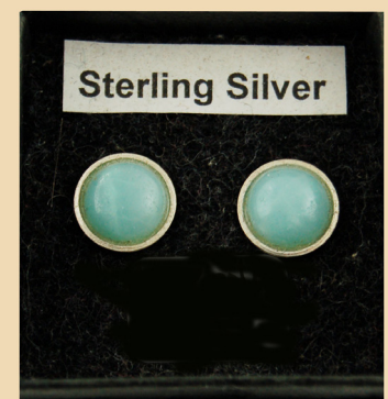
WS6 Amazonite round and Sterling Silver £26