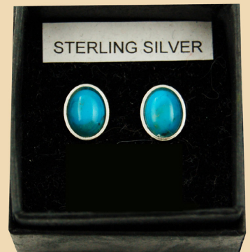
WS3 Turquoise oval and Sterling Silver £24