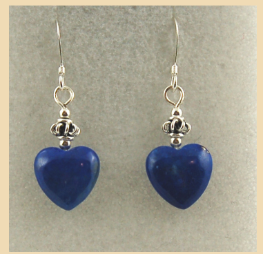
WE3 Lapis Lazuli hearts and Sterling Silver £38