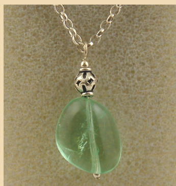
WP5 Fluorite green nugget and Sterling Silver £34