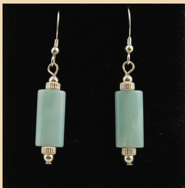
WE10 Amazonite cylinders and Sterling Silver £28