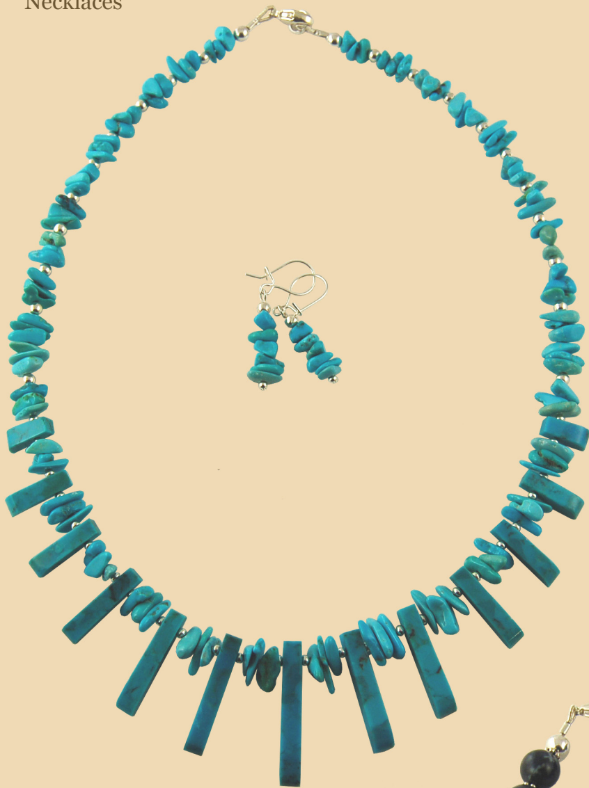
WN7 Turquoise chips and spikes and Sterling Silver £125