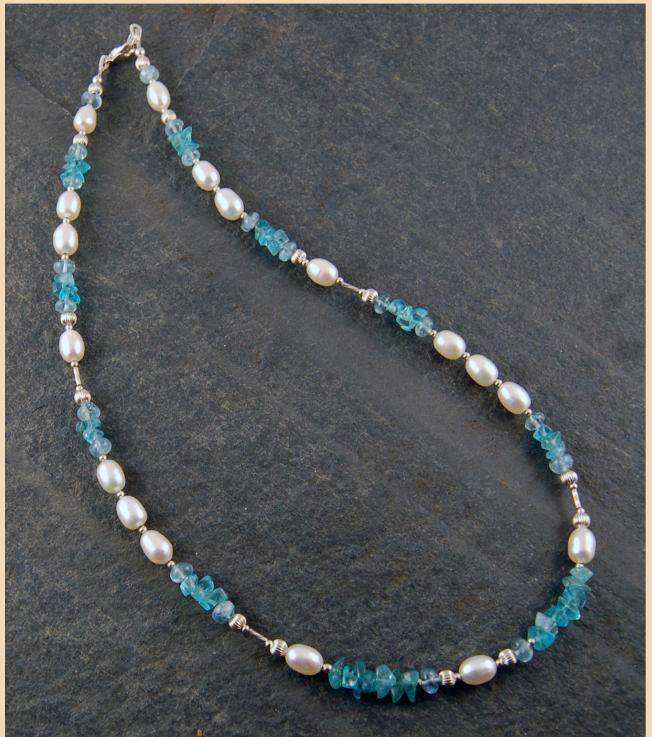
WN4 Aquamarine and white Freshwater Pearls and Sterling Silver £78