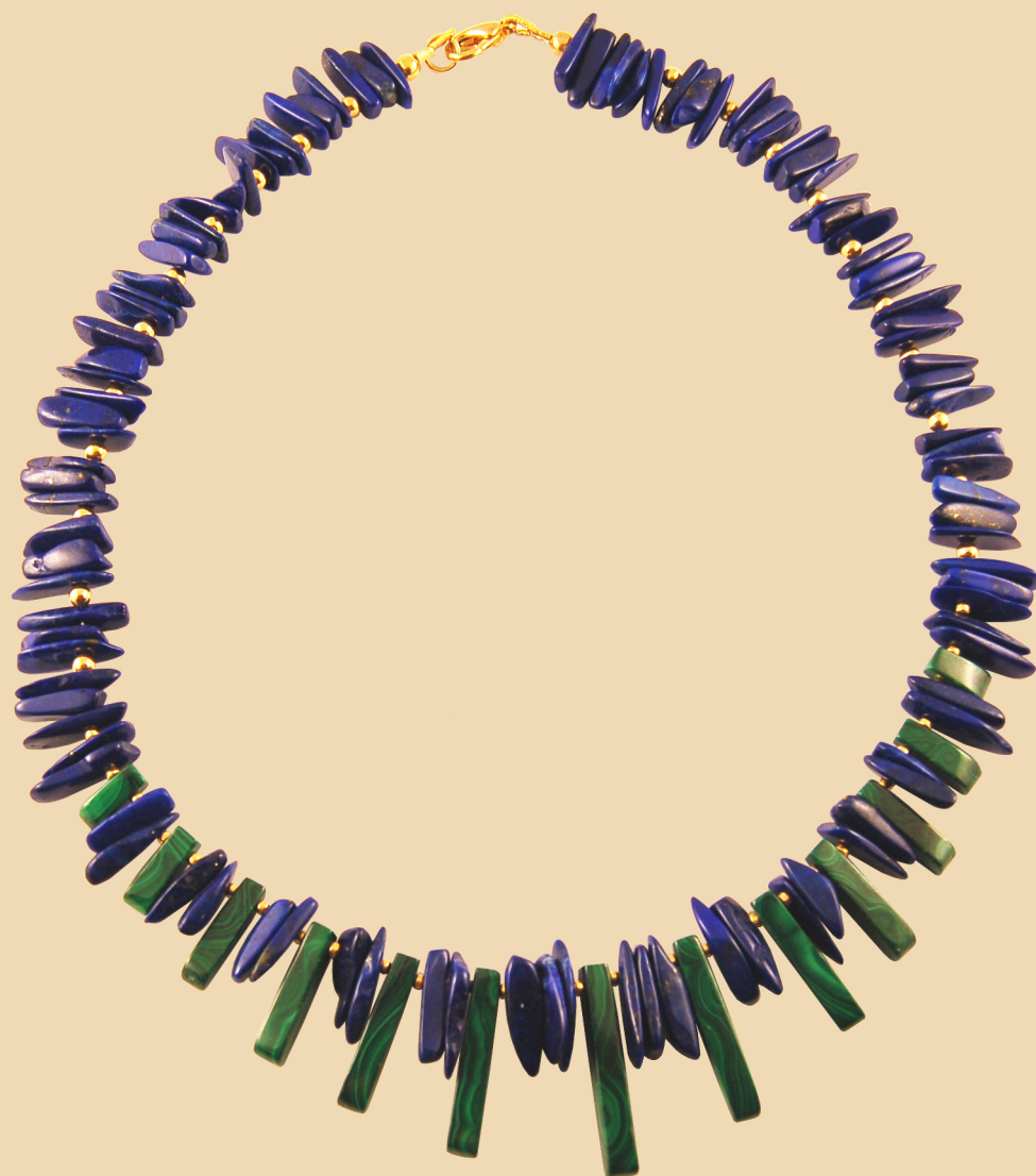
WN10 Lapis Lazuli chips and Malachite spikes, gold-plated £120