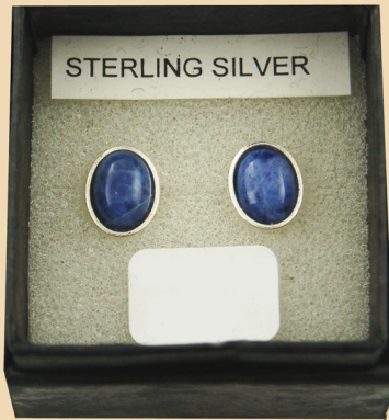
WS10 Sodalite small oval and Sterling Silver £24