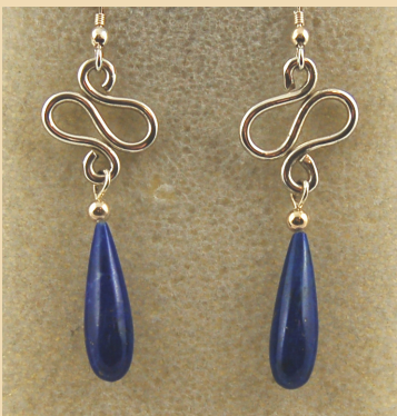
WE7 Lapis Lazuli drops with Sterling Silver squiggle £55