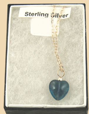
WP9 Fluorite blue heart and Sterling Silver £22