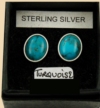
WS4 Turquoise large oval and Sterling Silver £28