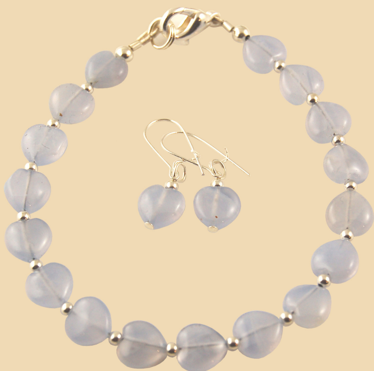
WB9 Blue Lace Agate hearts, silver-plated £38