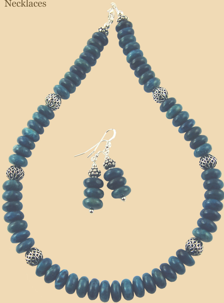
WN 3 Apatite buttons and Sterling Silver £120