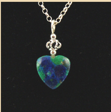
WP4 Azurite heart and Sterling Silver £36