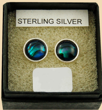
WS1 Blue Abalone round and Sterling Silver £26