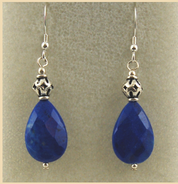
WE2 Lapis Lazuli faceted teardrops and Sterling Silver £35