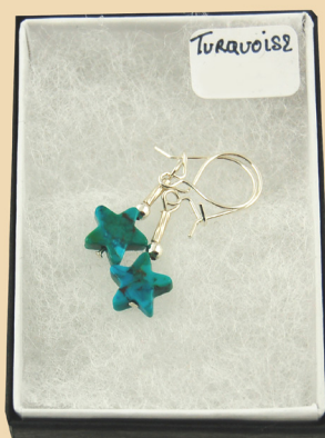
WE17 Turquoise stars and Sterling Silver £22