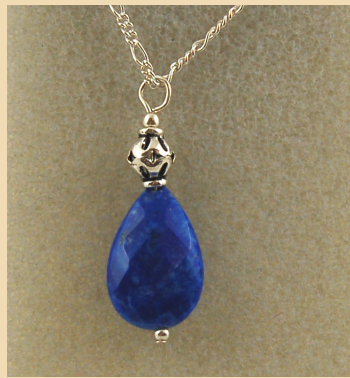
WP2 Lapis Lazuli faceted teardrop and Sterling Silver £35