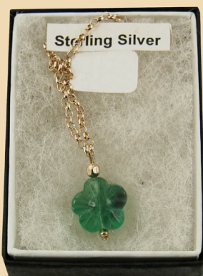
WP7 Fluorite green carved flower and Sterling Silver £28