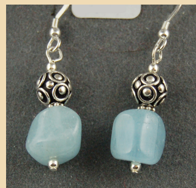
WE12 Aquamarine nuggets and Sterling Silver £44