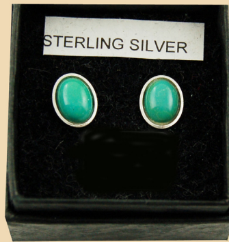
WS2 Turquoise small oval and Sterling Silver £24