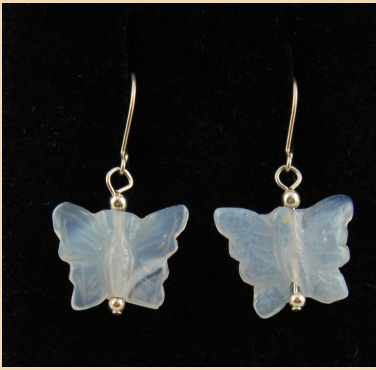
WE1 Blue Lace Agate butterflies and Sterling Silver £25