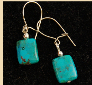
WE15 Turquoise rectangles and Sterling Silver £22