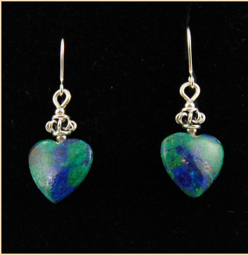
WE4 Azurite hearts and Sterling Silver £38