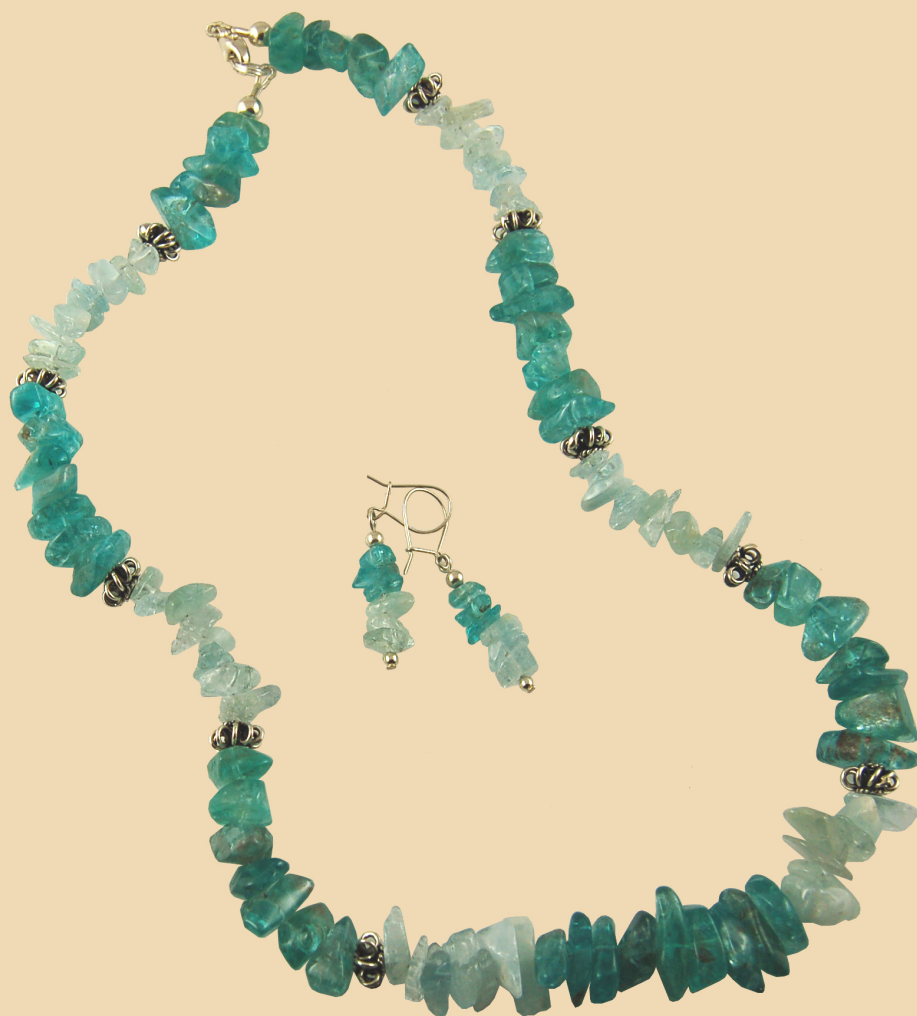
WN5 Aquamarine and Apatite chips and Sterling Silver £75