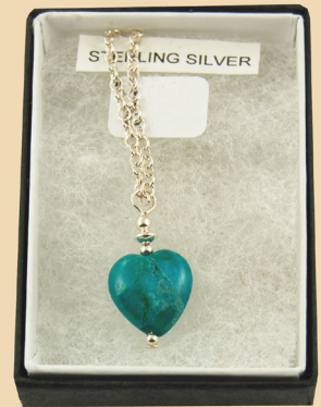
WP6 Howlite dyed heart and Sterling Silver £24