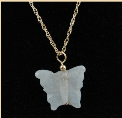
WP1 Blue Lace Agate butterfly and Sterling Silver £25