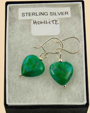
WE6 Howlite dyed hearts and Sterling Silver £24