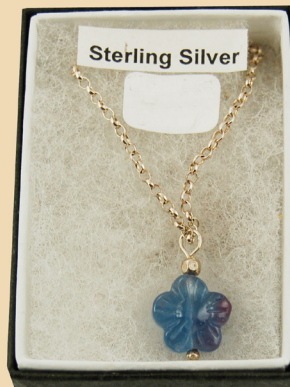
WP8 Fluorite blue carved flower and Sterling Silver £28