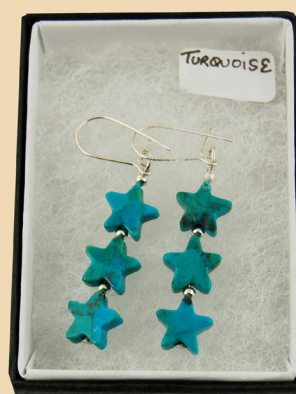
WE18 Turquoise triple stars and Sterling Silver £25