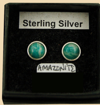
WS5 Amazonite small round and Sterling Silver £24