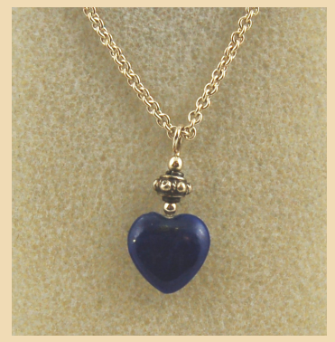
WP3 Lapis Lazuli heart and Sterling Silver £36