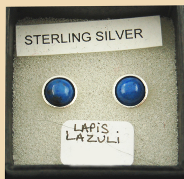
WS8 Lapis Lazuli small round and Sterling Silver £26