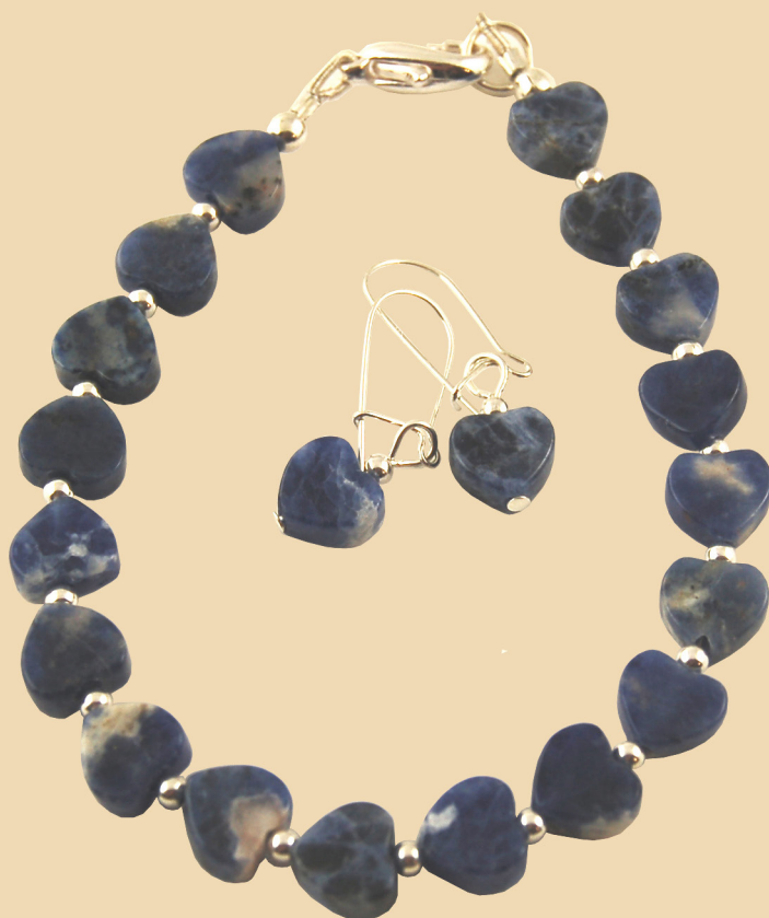
WB8 Sodalite hearts, silver-plated £38