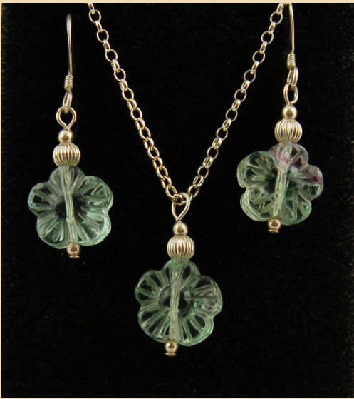
WSET 1 Fluorite blue/ green carved flowers and Sterling Silver pendant and earrings £48