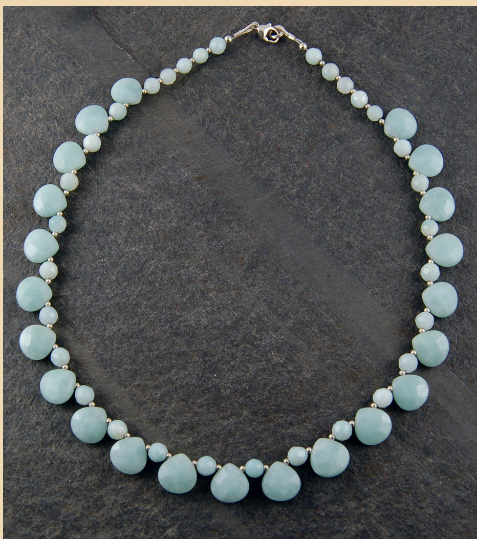
WN2 Amazonite faceted teardrops and beads and Sterling Silver £102