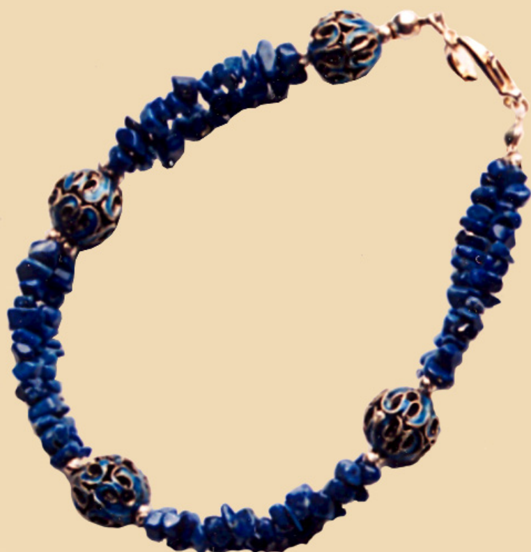
WB7 Lapis Lazuli chips and Blue enamel beads, silver-plated, double strand £47