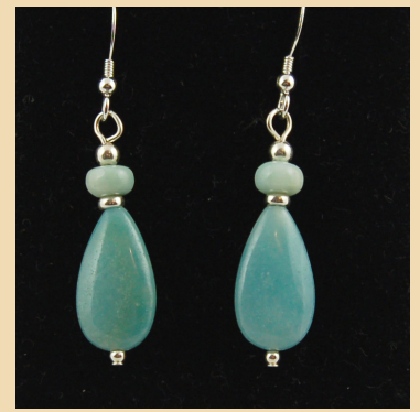
WE9 Amazonite teardrops and Sterling Silver £28