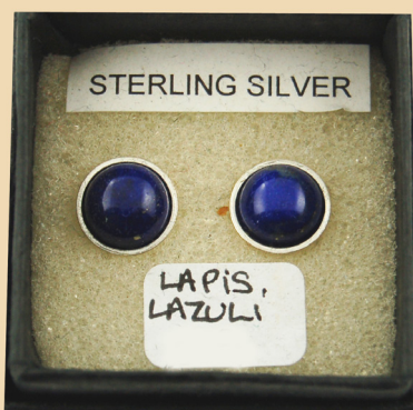
WS7 Lapis Lazuli round and Sterling Silver £34