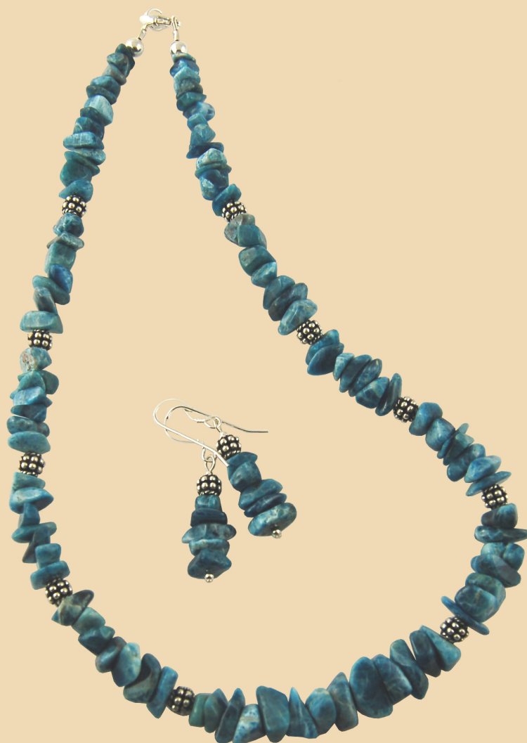
WN6 Apatite chips and Sterling Silver £75